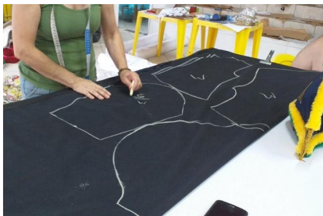
Figure 1b: Sandra marks patterns on the fabric