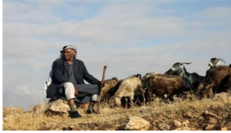
Figure 1: M'krat ala'sa