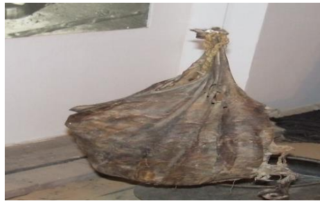
Figure 2: Kerbh