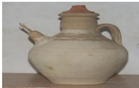
Figure 3: Kooz

This is a unit of weight that has gradually faded away, especially as the Bedouin stopped using the Kooz. But it is not yet entirely gone. There are people, like my father, who still believe that the Kooz keeps water better than a refrigerator – keeping it cool but not too cold. As a unit of weight, it was meant for the sale of herbal medicines. Every Kooz is equivalent to 1 kg.