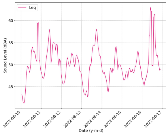
FIGURE 1 – L_{Aeq, 2h} : rolling average on all data (window size : 2h; step size : 40min). Output from the noisemonitor package at position two [6].

In addition to discrete indicators, the noisemonitor package can perform overall and daily rolling averages on either L_{eq} , L_{10} , L_{90} , or L_{50} values, with the option of choosing window and step sizes. The result can be plotted with a dedicated function, as shown in the next figures. The analysis can be performed on all data (see Figure 1), but also at specific days of the week and times of the day (see Figures 2 and 3).