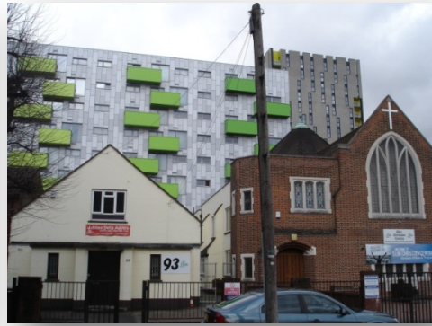
Figure five: Barking Town Square development ORIGINAL FILES FOR ALL IMAGES AVAILABLE