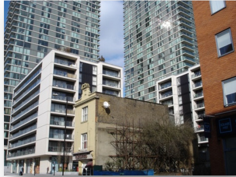
Figure eight: Tower Hamlets development ORIGINAL FILES FOR ALL IMAGES AVAILABLE