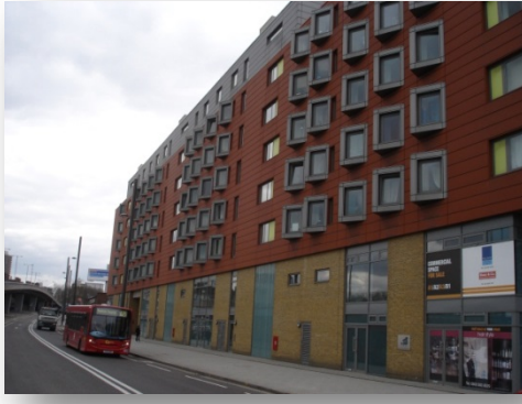
Figure seven: Newham development. ORIGINAL FILES FOR ALL IMAGES AVAILABLE