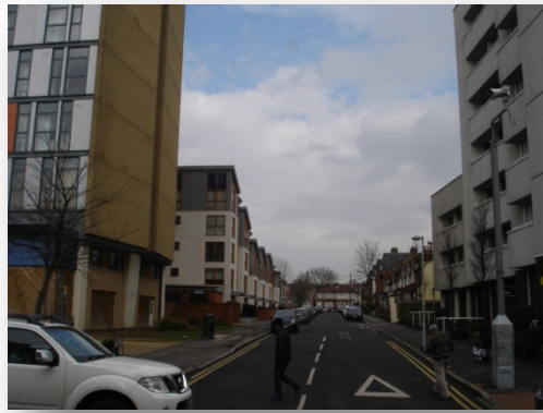
Figure six: Croydon development ORIGINAL FILES FOR ALL IMAGES AVAILABLE