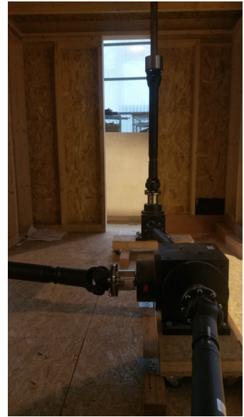
Figures 3a & 3b.