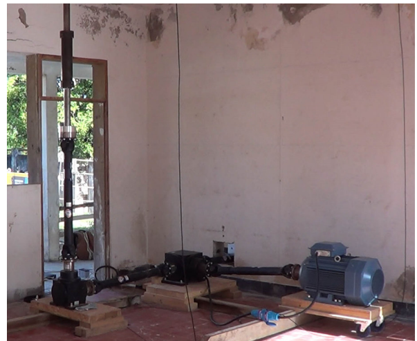
Figures 5a & 5b.

New mechanical parts have recently be designed and produced in order to simultaneously reduce the initial misalignment and increase the lateral stiffness of the vertical drive shafts. A test bed is currently being set up in the ENSA Nantes premises in order to validate the