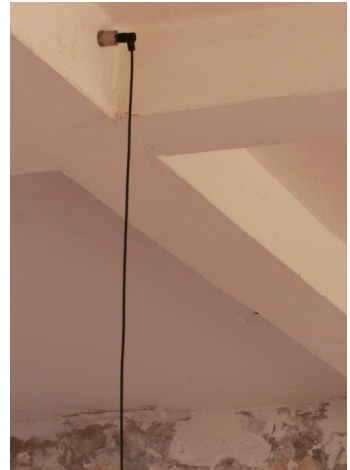
Figures 4a & 4b.