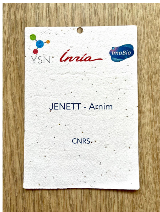
Fig. 2. Ecological badge of one of the participants.