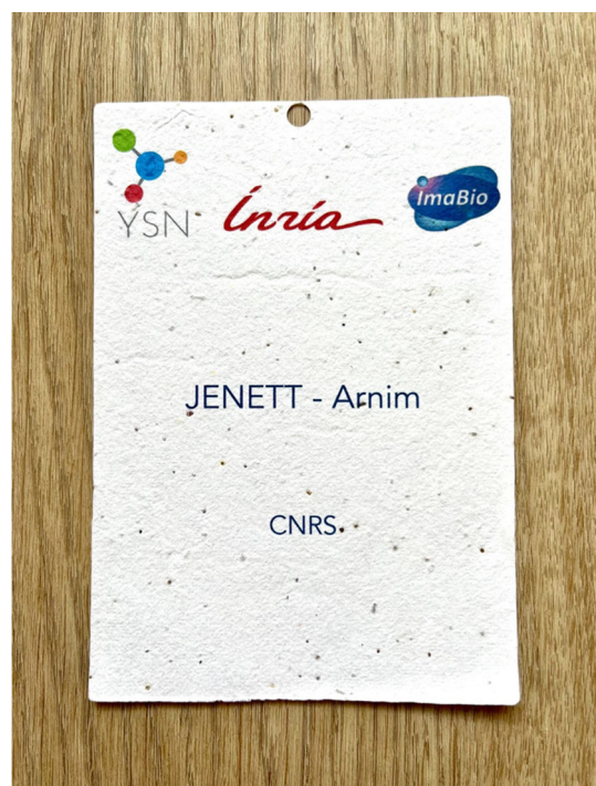
Fig. 2. Ecological badge of one of the participants.