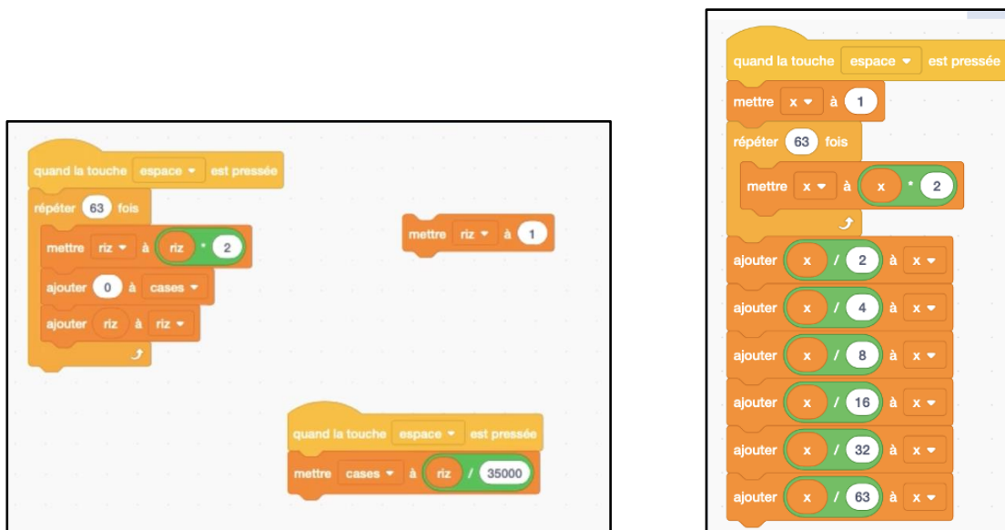
Figure 4. Codes produced by two groups of students

Question 2 was correctly solved by four groups. Two other groups spent too much time on question 1 and had no time left for the next one. The two remaining groups failed in solving the question for different reasons. One group omitted the initialization of the variables, which, by default, are set to 0 (Fig. 4, left). This might indicate an insufficient knowledge of the programming environment and the interference of the mathematical meaning of a variable for which an initialization is not necessary.