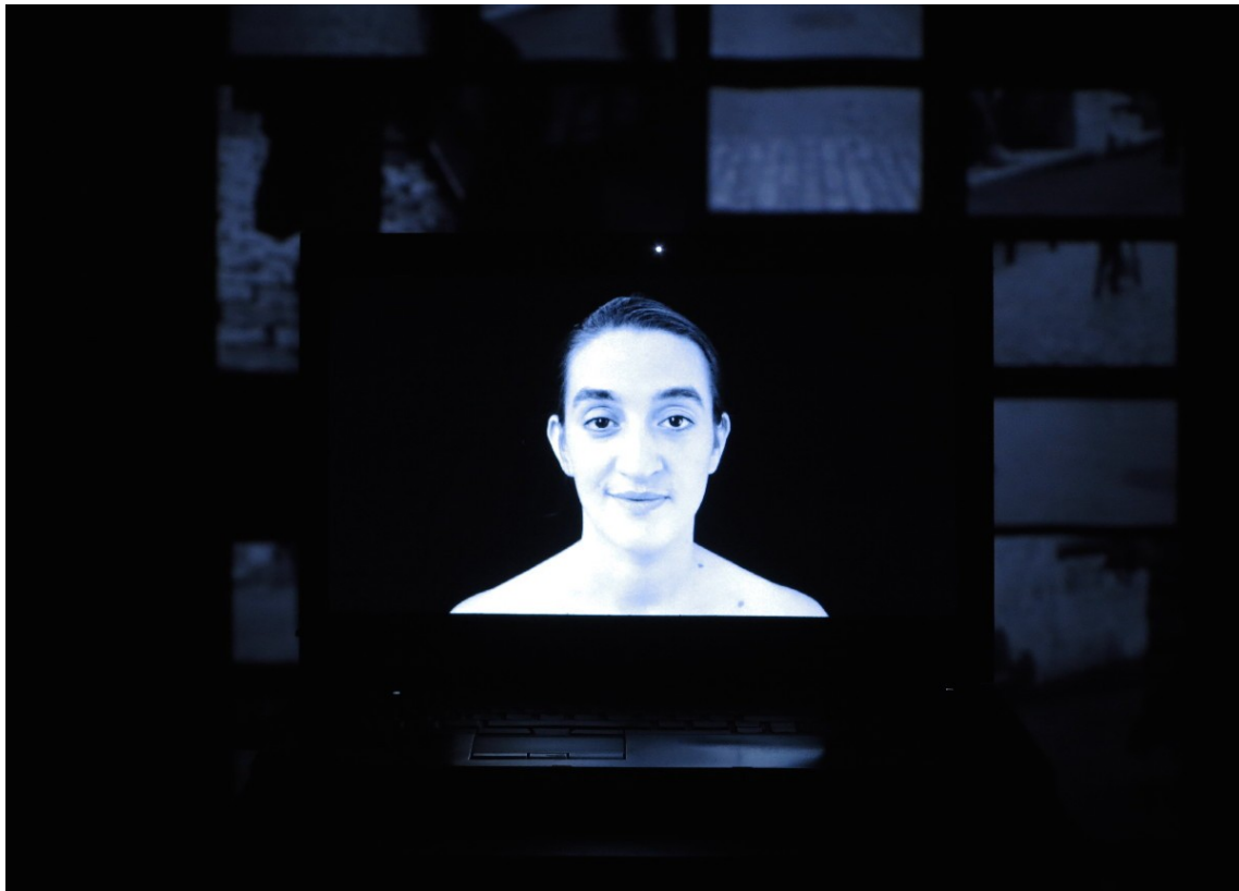
Fig. 3. The computer-icon. ©Veronique Caye

A soundtrack created by Frédéric Minière is played in interaction with the visitors' movement. When they see the installation from afar, they take part in a sonic journey through the streets of Jerusalem with footsteps, police sirens, church bells, calls to prayer, songs and so on. When they come close to the icon, the latter is transformed and takes features of their own face. At the same time, the noises of the city are interrupted to give way to a sound evoking the heartbeat, to emphasize intimacy. This sound reinforces the astonishment when the spectators see their face and confront themselves with in their own privacy.