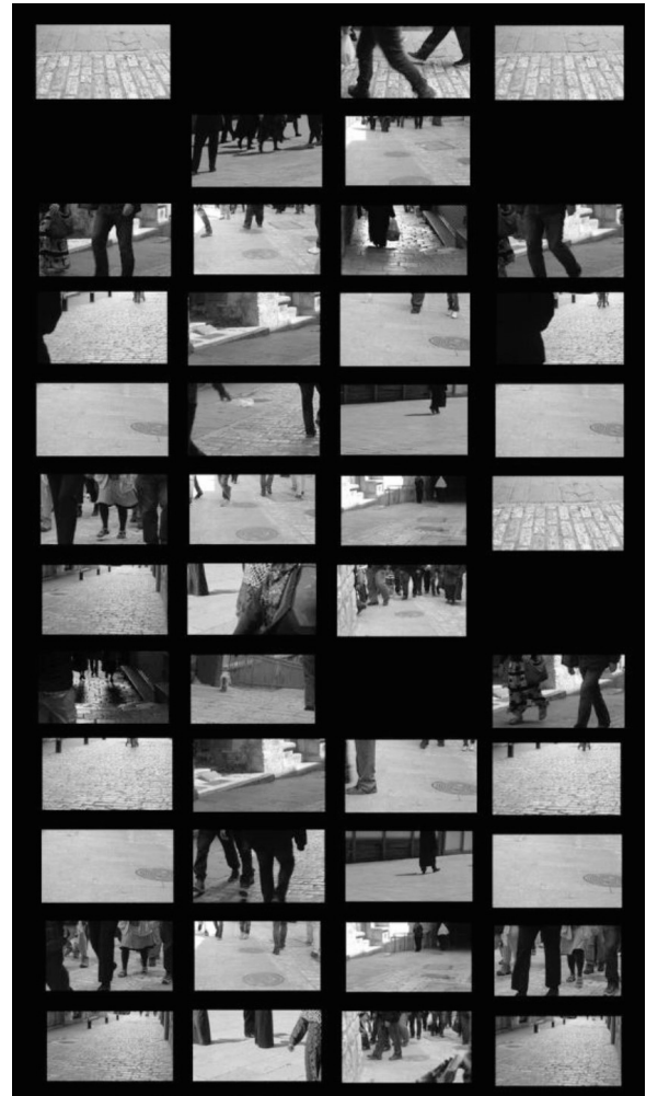
Fig. 2. Mosaic of passers-by in Jerusalem (videos).