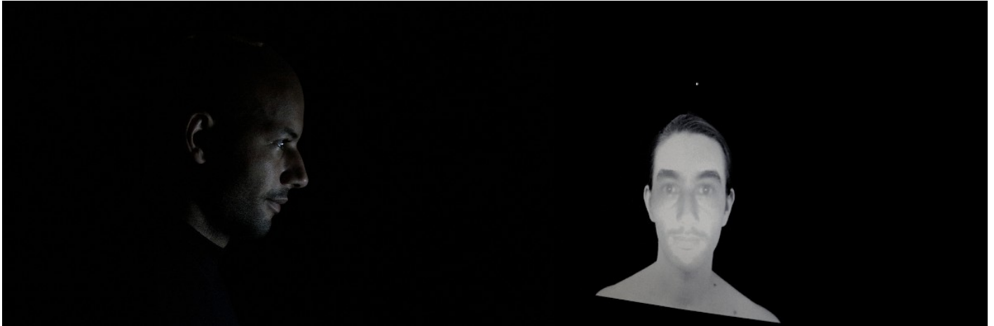
Fig. 5. The visitor's face is captured by the computer-icon.

In addition, this program triggers an event during the detection of the visitor and sends it to the Max for Live software via UDP (using OSC Open SoundControl [32]) to control the change of sound environment. The code was developed in C + + at LIMSI with the help of several opensource libraries: OpenCV [33] and Dlib developed since 2009 [34].