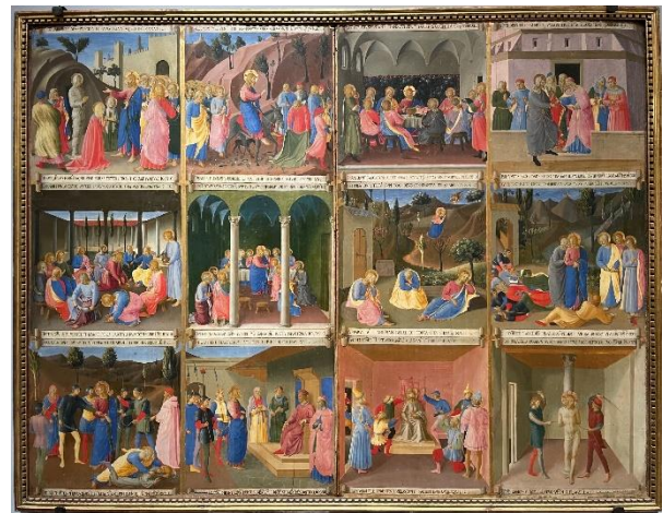
Fig. 2: Fra Angelico, Armadio degli Argenti, second panel, 1448-1450, tempera and gold on wood, 123 x 160 cm, Florence, Museo Nazionale di San Marco