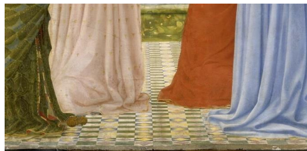
Fig. 6: Fra Angelico, Coronation of the Virgin , Louvre, detail of the marble floor, © 1997 RMN-Grand Palais (musée du Louvre) / Jean-Gilles Berizzi.

The elevated position of the altarpiece probably reinforced these dynamic lines since the viewer had to look up to see the whole scene. This is emphasized by the surprising double perspectival system: the first for the crowd at the foot of the steps and for the tiling on which they stand, and the second for the canopy under which Christ crowns the Virgin. This scene was designed to be seen by the faithful on their knees, like the saints at the bottom of the stairs. The steps leading to the throne and the baldachin are seen from below, while the Virgin, Christ and the walls of the baldachin are depicted as if the viewer were at the same height as them.