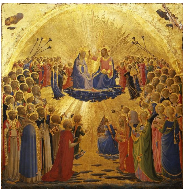
Fig. 9: Fra Angelico, Coronation of the Virgin, 1431-1432, tempera and gold on wood, 117 x 115 cm, Florence, Galleria degli Uffizi

Many similarities appear when comparing the altarpiece in the Louvre with the one in the Uffizi, which may have been painted for the church of the Santa Maria Nuova hospital around 1431–1435. 32 In both paintings, the chromatic range is somewhat restricted, but with an extensive variety of nuances and tones. In the Uffizi's painting, the dominant colours, blue and red, are multiplied in different hues throughout the altarpiece ( Fig. 9 ). As in the Coronation of the Louvre, the shades are distributed in a thought-out manner on the panel, giving an impression of many colours despite the small number of tints. Blue, for example, declined in four or five shades: one on the mantle of Christ, another on that of the