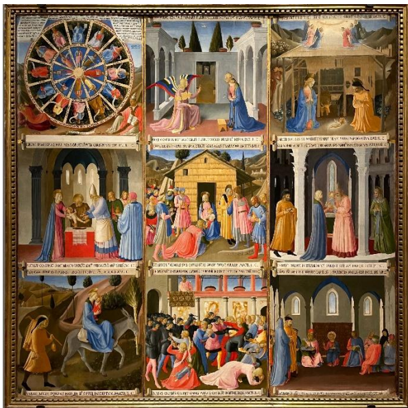
Fig. 1: Fra Angelico, Armadio degli Argenti, first panel, 1448-1450, tempera and gold on wood, 123 x 123 cm, Florence, Museo Nazionale di San Marco