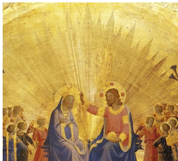
Fig. 10: Fra Angelico, Coronation of the Virgin , Uffizi, detail of the gold ground.

Many similarities appear when comparing the altarpiece in the Louvre with the one in the Uffizi, which may have been painted for the church of the Santa Maria Nuova hospital around 1431–1435. 32 In both paintings, the chromatic range is somewhat restricted, but with an extensive variety of nuances and tones. In the Uffizi's painting, the dominant colours, blue and red, are multiplied in different hues throughout the altarpiece ( Fig. 9 ). As in the Coronation of the Louvre, the shades are distributed in a thought-out manner on the panel, giving an impression of many colours despite the small number of tints. Blue, for example, declined in four or five shades: one on the mantle of Christ, another on that of the