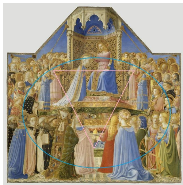
Fig. 8: Fra Angelico, Coronation of the Virgin , Louvre, colour construction.

To those moving phenomena static lines are added to create the stability of the image ( Fig. 8 ): the two angels dressed in pink just above the angels in blue form with the pink cloak of Bernard de Clairvaux an inverted triangle that encloses Christ and the Virgin. In the same way, all the blue touches form an ellipse surrounding the main characters of the scene, putting them at the centre of the image by pushing them downwards. The double perspectival system echoes a double dynamic created by the colour: the first one moves the gaze upward towards the Christ and the Virgin, accentuating their superior position in the image; the second one pushes it towards the centre of the pictorial surface. Christ is shown both as the head of the body of the Church and its centre and the Virgin as its mother and one of its members.