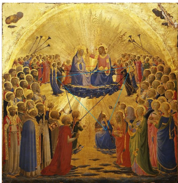
Fig. 12: Fra Angelico, Coronation of the Virgin , Uffizi, colour construction.

four angels in front. This complex construction is even more interesting if we note that those six angels form a circle around the pair: the movement created by the position of the angels clashes with the static lines created by the colour of the angels' clothes. While the lines formed by the blue and black angels put the mother and the son at a distance from the viewer, these same angels form two triangles with the blue organist angel and the angel in black playing the vielle in the foreground, which bring mother and son to the forefront. Again, this tends to diminish the effect of depth created by the heavenly court. Christ and the Virgin seem to both float in a golden sky and to be placed on a golden background as if they were soaked up by the environment where they stand out.