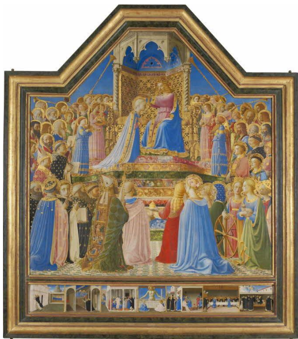
Fig. 4: Fra Angelico, Coronation of the Virgin, 1427-1429, tempera and gold on wood, 209 x 206 cm, Paris, musée du Louvre

Unlike the Armadio , the Louvre Coronation of the Virgin is, if only its main part is considered, composed of a single image, particularly representative of the use of colour as a way of constructing the image, but in a slightly different way from what we just saw. In this artwork, the painter uses colour as a tool to construct the image and to guide the spectator's eye to the most important part of the image as opposed to the Armadio , where colour guides it through different spaces. (Fig. 4)