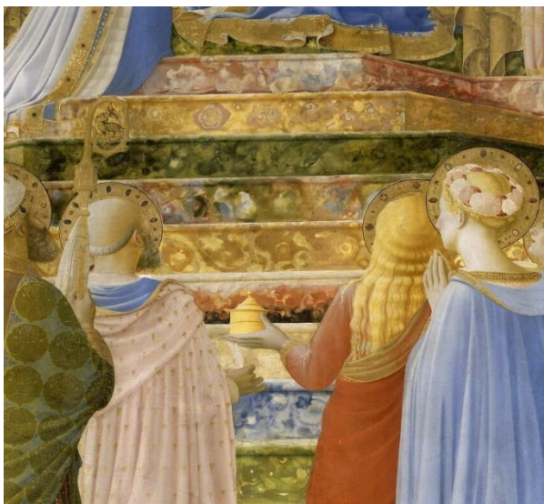
Fig. 7: Fra Angelico, Coronation of the Virgin , Louvre, detail of the steps, © 1997 RMN-Grand Palais (musée du Louvre) / Jean-Gilles Berizzi.

the effect of depth, while beige, yellow and pink temper it. Green and blue occupy a larger surface area in the tiling. The green of the tiles is in direct response to the marble of the first step of the staircase: when looking at the floor, the eye is almost directly drawn to this step and sinks into the picture. The impression of depth is thus significantly reinforced through colour: while facing the painting, the viewer sees a marble floor that sinks deep into the space until it reaches a flight of steps that ascend towards the central point of the scene.