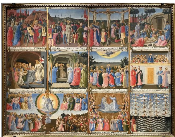
Fig. 3: Fra Angelico, Armadio degli Argenti, third panel, 1448-1450, tempera and gold on wood, 123 x 160 cm, Florence, Museo Nazionale di San Marco

(Fig. 1 to 3). Only thirty-two of the forty pieces commissioned have survived. 14 The church of the Santissima Annunziata preserves on the reverse side of its facade a fresco representing an Annunciation considered an acheiropoieton from the second quarter of the 14 th century: according to tradition, the face of the Virgin Mary was painted there by an angel. The Santissima Annunziata thus became a central church in the Florentine religious landscape. In 1440, Piero the Gouty, one of the sons of Cosimo de' Medici, undertook a restructuring of the basilica's architecture. He ordered Michelozzo to construct a baldachin enclosing the Annunciation behind gates. The chapel on the right of the fresco was also reorganized: it was intended for the offices of the Servite friars and Piero's personal devotions. Piero also commissioned Fra Angelico to decorate the door of a reliquary located in a niche, which still exists, in the first left side chapel of the church. 15 The commission was prestigious as it was meant to shelter the silver ex-voto offered by the faithful to the Virgin. Its original aspect is unknown, but "it is known [to be] commissioned for a new oratory that Piero de' Medici had built adjacent to the chapel of Santissima Annunziata and near the room in the convent where he had provided a spiritual sanctuary for himself in emulation of his father's arrangements at San Marco". 16