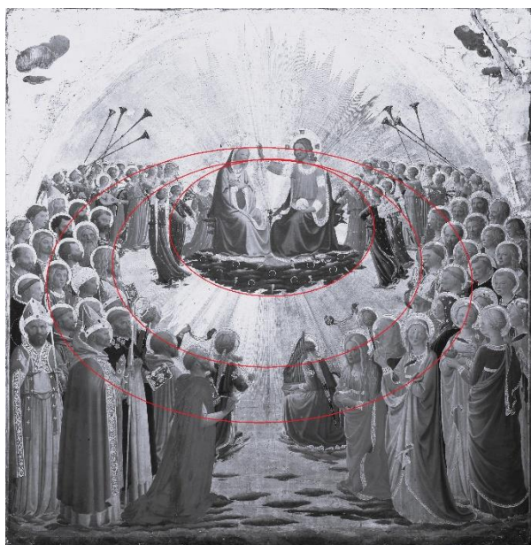
Fig. 11: Fra Angelico, Coronation of the Virgin , Uffizi, spatial construction.

attenuating the sensation of depth created by the ellipse of the characters. Everything concurs to sublimate the moment of the coronation, suspended in time, out of time itself: the golden background freezes and inlays the scene in a non-physical place, Heaven, a place outside the world. According to Gerbron again, “Christ and the chosen ones are seen in weightlessness, in front of a golden surface which doesn’t create any place and doesn’t maintain a spatial relationship with the figures”. He points out that “gold is the light-as-medium where [these figures] evolve”. 34 The spectator would thus be in front of an instant frozen in eternity, as shown by the gold ground.