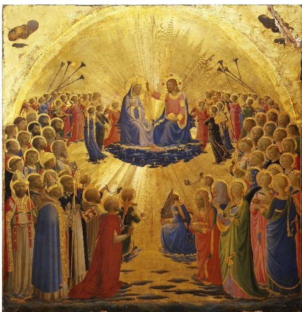
Fig. 9: Fra Angelico, Coronation of the Virgin, 1431-1432, tempera and gold on wood, 117 x 115 cm, Florence, Galleria degli Uffizi

Many similarities appear when comparing the altarpiece in the Louvre with the one in the Uffizi, which may have been painted for the church of the Santa Maria Nuova hospital around 1431–1435. 32 In both paintings, the chromatic range is somewhat restricted, but with an extensive variety of nuances and tones. In the Uffizi's painting, the dominant colours, blue and red, are multiplied in different hues throughout the altarpiece ( Fig. 9 ). As in the Coronation of the Louvre, the shades are distributed in a thought-out manner on the panel, giving an impression of many colours despite the small number of tints. Blue, for example, declined in four or five shades: one on the mantle of Christ, another on that of the