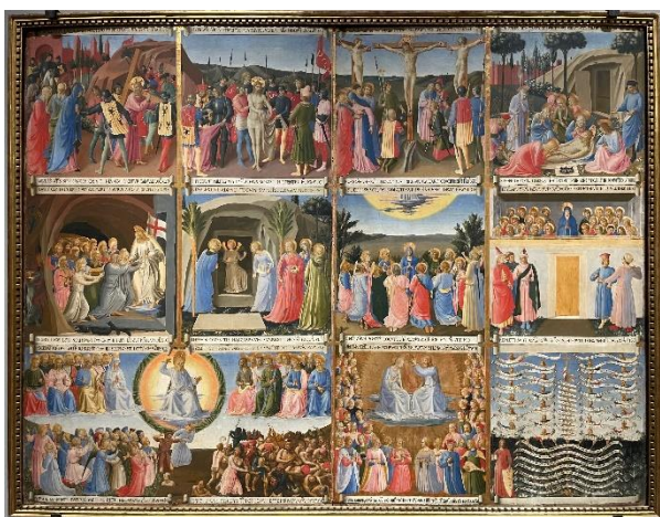
Fig. 3: Fra Angelico, Armadio degli Argenti, third panel, 1448-1450, tempera and gold on wood, 123 x 160 cm, Florence, Museo Nazionale di San Marco