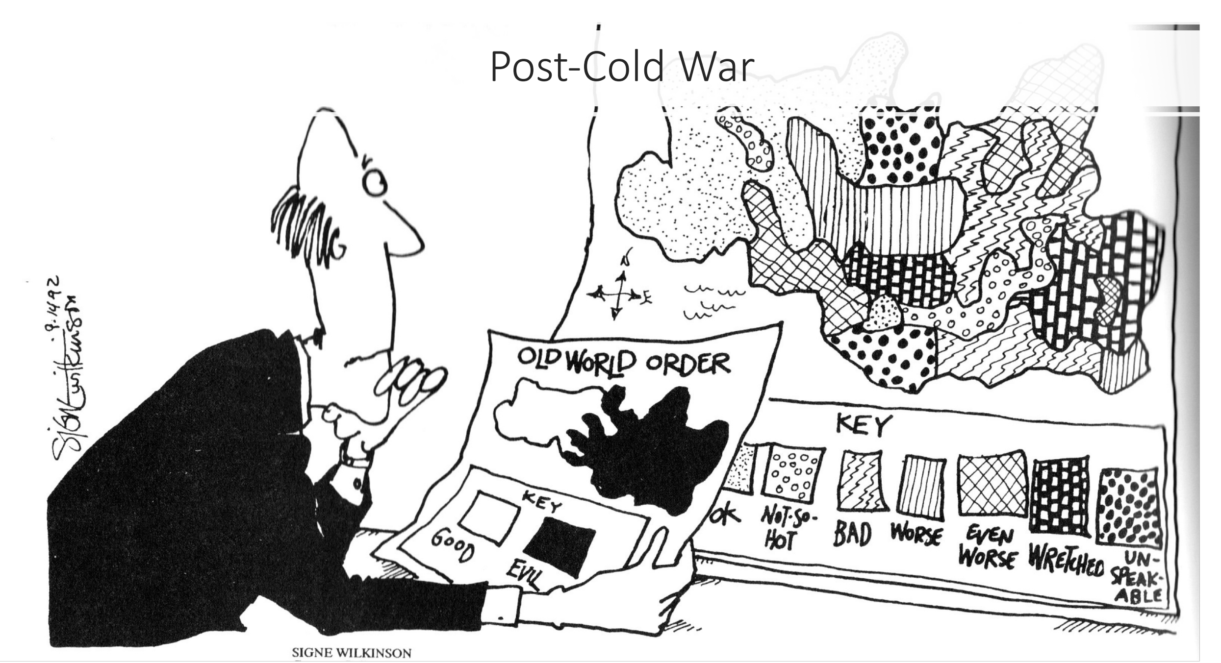
Source: Signe Wilkinson, Philadelphia Daily News, 14 September 1992 in Charles Brooks, ed. Best Editorial Cartoons of the Year: 1993 Edition (Gretna, LA: Pelican, 1993), 72.