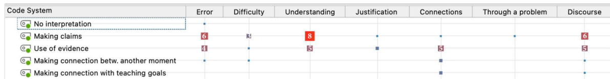
Figure 2: The intersection of attention and interpretation codes

Furthermore, we observed that some codes occurred together more than others during coding. Therefore, we wondered whether there could be some relationship between the teacher's interpretations and attention. Specifically, it seemed to us that Ayşegül might provide a piece of evidence when she attended to student understanding or students' correct answers. The code relations feature of MAXQDA was used to check these insights. The following figure indicates the number of intersections of codes about student thinking with the interpretation codes. The analysis also included the discourse category because Ayşegül generally attended to various students' thinking when she attended to the discourse in the classroom.