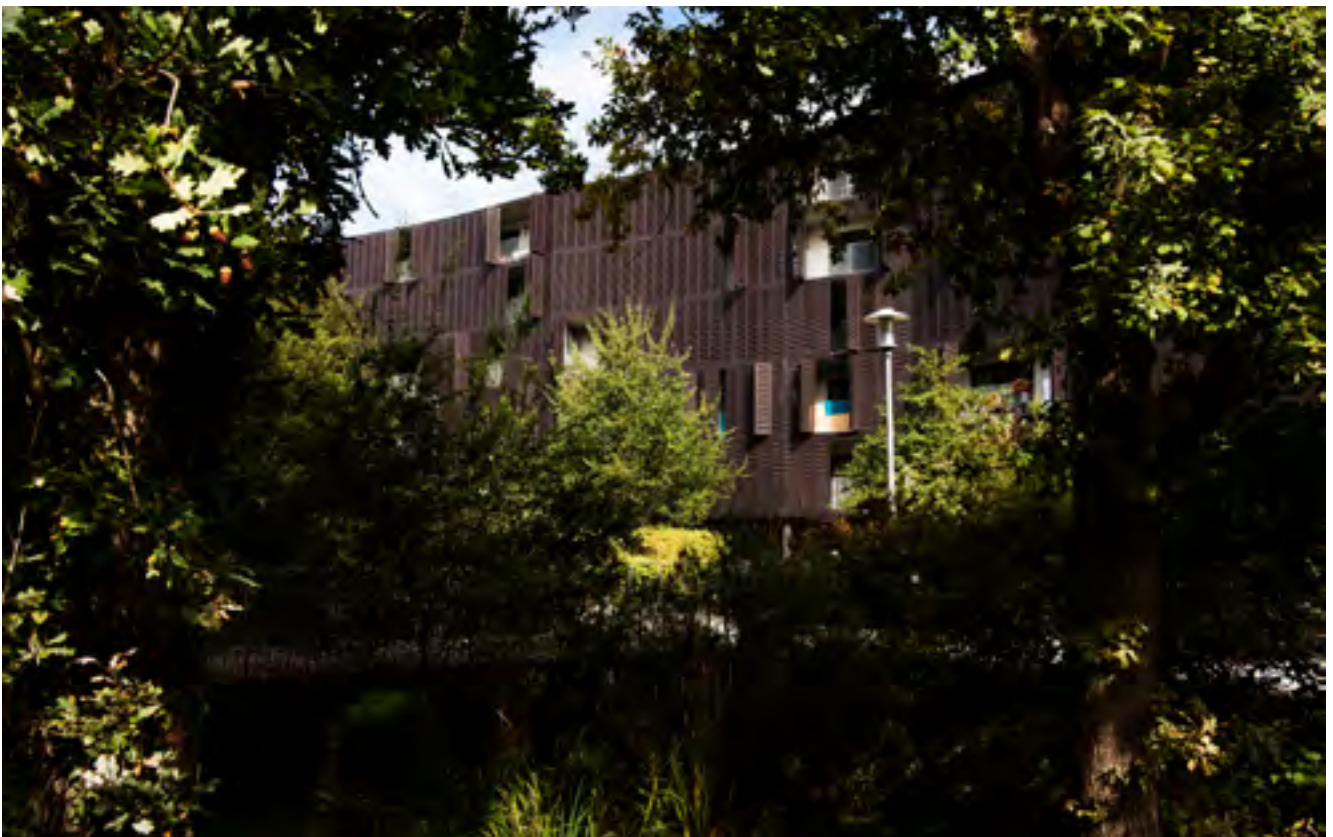
Figure 2-3 87 housing at Bègles, Terre Sud, Bordeaux Metropolitan District 2012. ©Michel Dubeau/LLTR architects urbanists*

In operational terms, eco-neighborhoods have become very frequent in Bordeaux. Priority is given to building affordable, comfortable housing with the necessary public utilities. The housing is also designed to combat energy waste, reduce the perceived heat of the city, and provide a calming environment, with the planting of trees and the creation of shared gardens. Apart from residential and infrastructural buildings, canals, basins, ponds, rainwater retention basins, and almost wild flora form part of the landscaped framework of these new residential areas, and this specifically promotes biodiversity. [Figure 2 - Ginko] Revegetation in the city is a remarkable process. It is becoming one of the most profitable development solutions in terms of improving both comfort and health: “Even though planting, watering and looking after a tree costs money, revegetation is the cheapest and most profitable tool for combating heat islands. In Quebec, it is estimated that for every dollar invested, one tree delivers five or six dollars’ worth of services: it removes pollution from the air, provides shade, and stores carbon.” (pers.comm., engineer professor in hydrogeology, ENSEGID, 2019) There has nevertheless been an unpleasant experience recently: an invasion of mosquitos has had an adverse effect on urban dwellers’ recreational practices, and has heightened fears of an increase in the transmission of diseases (e.g., Zika, dengue).