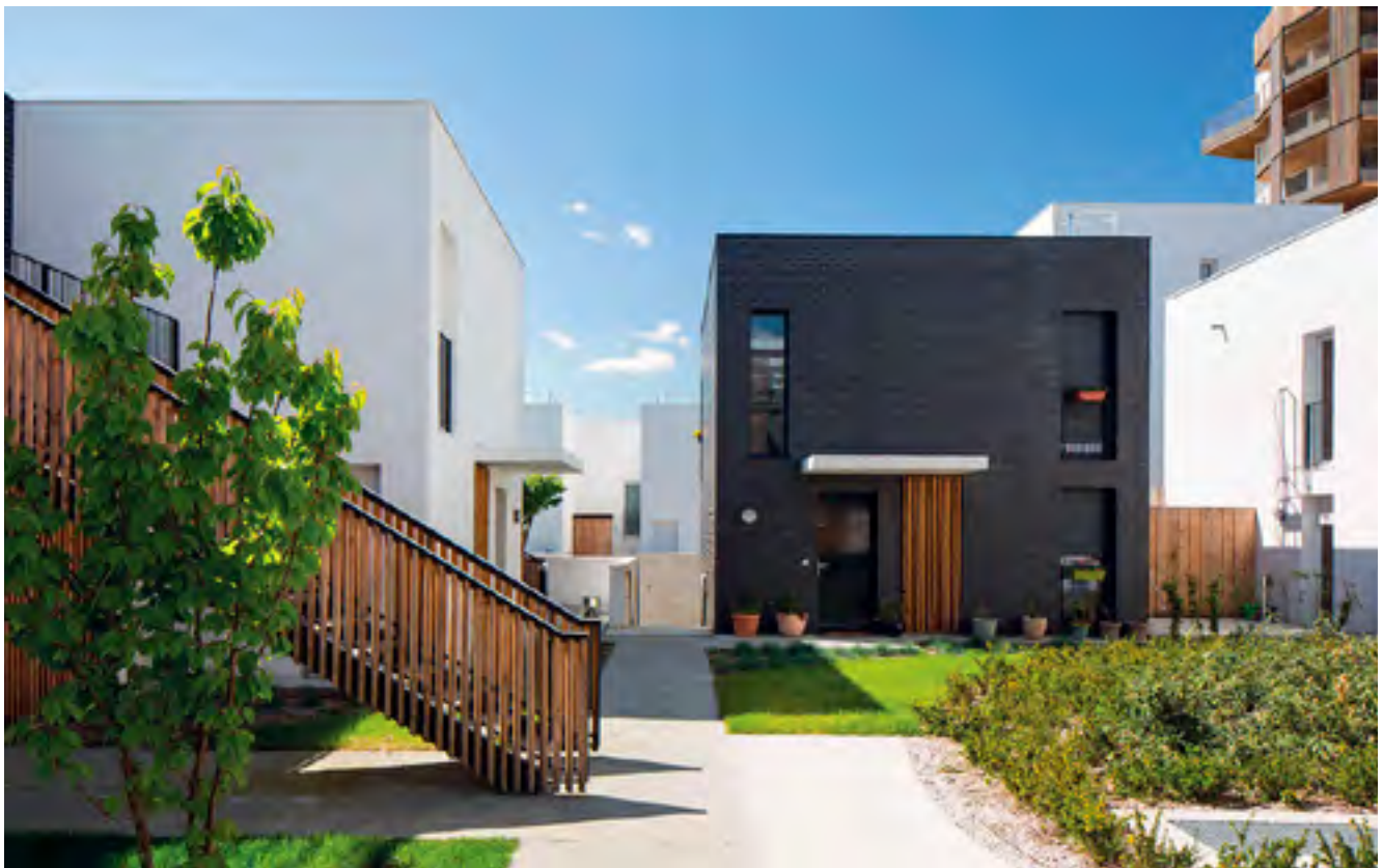
Figure 2-2 Eco district Ginko, Bordeaux Metropolitan District 2020. ©2022 - BLP & associés, agence d'architecture depuis 1984*

In France, the very recent objective of “zero net artificialization” set in the 2018 biodiversity plan was reinforced in 2019 by an official communiqué accentuating the mobilization of local players. The objective is to stop artificializing in the long term, while leaving the possibility of compensating for artificialization. This requirement, in addition to the densification of existing urban areas (‘Solidarity and Urban Renewal’, ‘Access to Housing and Renovated Urbanism and ‘Grenelle II’ legislation), engages a radical transformation of the way of developing urban projects, mobility networks and urban services. Moreover, every plot of land that was or had become free had to incorporate a commercial circuit in the urban economy – it had to be built on in order to sell housing, offices and facilities. The change in paradigm is spectacular, given that the land and housing market is extremely strained. Between 1999 and 2012, the redevelopment of the left-bank riverside, referred to as “gardened quays” (quais jardinés), was a key project in Bordeaux (Godier, 2018); it marked the start of the introduction of nature into the city, emphasizing the landscape and plants rather than the tradition of Bordeaux as a ‘city of stones’ and concrete public spaces.