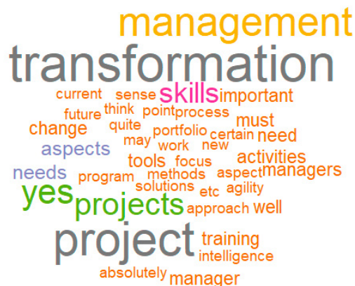
Fig. 3. Word cloud of the respondents' qualitative feedback

In order to derive further insights based on open-ended questions covering feedback on the skills set, a word cloud was generated using the R software package [17] (Figure 3). Unsurprisingly, it can be seen that the most discussed topics include transformation, projects and management. This shows also that the positioning is quite relevant to the companies. Other keywords were also mentioned such as intelligence, agility, change, sense that witness the importance of addressing priority topics such as business agility when defining elaborating the skills. The word cloud does not bring further value since the questions were open-ended and the respondents may use completely different vocabularies.