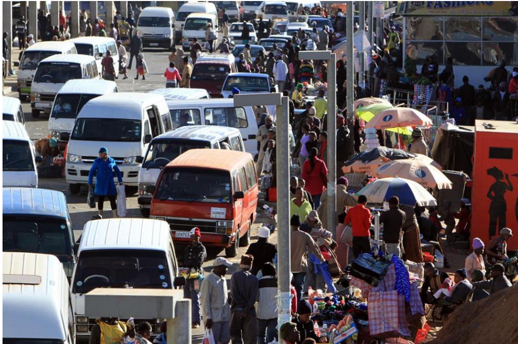
Figure 1: MTN minibus taxi rank

Safety is linked with increased criminal activities, the poor state of roads, and lack of supporting infrastructure at stations, drop-off locations and around the city. Certainly, most of the crimes take place around MTN taxi rank (figure 1), also called the most notorious place in the city of Johannesburg according to the respondents. The rank is the only station for minibus taxis feeding the whole of Gauteng province.