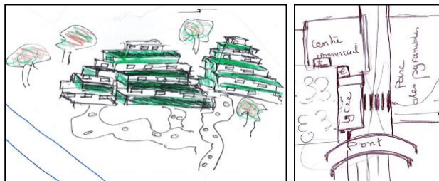
Figure 3. Figurative symbols and drawings: display in 3D of buildings and of a bridge.

to be displayed in 3D and 2D was used partly due to drawing limitation. The space travelled along an itinerary is displayed thanks to a line or to successive arrows. In the narration of the different texts, disorientation or interrogation about the location of places are described though have not been displayed in the maps.