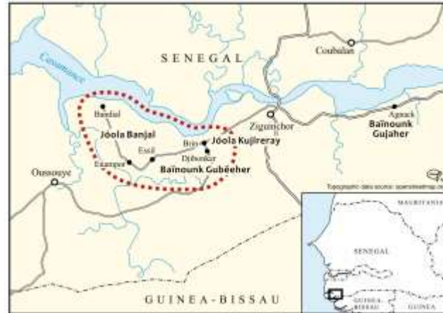
Figure 1. The crossroads area

Residents of the crossroads villages do not necessarily adhere to any one fixed ethnic identity, and the fluidity of their identity is projected through their linguistic practices. Through an exploratory study of greetings at this crossroads, this article seeks to examine the ways in which residents of the crossroads area identify through accommodation strategies of pronunciation. Specifically, the article seeks to answer the following research question: Is it possible that the prototypical pronunciation of the inhabitants of Essil has diverged from those of Brin and Djibonker as a way of distancing themselves from what they interpret as a Baïnounk identity?