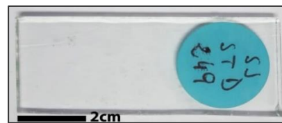
Figure 1. Photograph of the colorless glass sample used in this study.

This work was performed on a contemporary colorless glass (used for restoration) provided by the glass factory of Verreire de Saint-Just located in Saint-Just-Saint-Rambert, in Loire (France). The dimensions of the piece are 4 cm x 1.5 cm x 2 mm (figure 1). The glass surface was covered with permanent ink in order to observe the phenomenology that takes place during the laser cleaning.