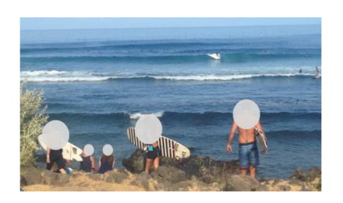
Fig. 3 About fifteen surfers defying the ban on the Trois Bassins spot (Sept. 25, 2018)

This plurality of knowledge is also shared by some waterbased practitioners who have adapted to the risk by endorsing new attitudes to cohabit with sharks, by developing strategies to reduce shark-risk encounters. It can be proven by counting increasing numbers of water-based activities practitioners on surfing spots when there is swell coming in, then refusing to conform to the ban. That return to water flow could also be linked with the absence of SHIs since May, 2019, thus conditioning an acceptance of the risk of encounter. This risk-taking is not well accepted by the citizens and the water-based activities practitioners who made the choice to comply with the rules, not returning to water. "I acknowledge that the underwater lookouts and the no-sharks devices work, but I wouldn't go in the water and be used as bait. I have a little girl and we're expecting another one, so I choose not to be selfish. You can't really talk about it with people who are still surfing. I can not be friends with those people anymore. I think that's selfish of them." (Tao, citizen). Parenthood