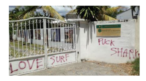
Fig. 4 Deterioration at the entrance to the RNMR premises (December 4, 2018)

These interviews also provided information on poaching. They highlighted that the number of poachers is an indicator of a non-concerted environmental management tool. "There were 90 tickets issued in 2017. The RNMR is among the French natural reserves where the most fines are given... We do a lot of sorting, otherwise it would be around 300 or 400 tickets a year. It has always been, it is anchored, it is like that" (Fredo, RNMR staff). As far as SHIs risk reduction is concerned, relations between the two public benefit