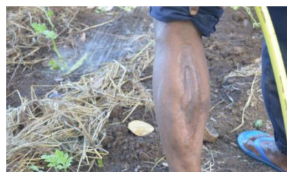
Fig. 5 A fisher bitten by a shark on the calf in Ste Suzanne (March 12, 2019)

Table 5 shows several fragments of local newspaper's articles which were relayed on social networks and had the effect of stirring up conflictual relations. The almost daily interactions/altercations between pro-shark fishing and anti-shark fishing stakeholders on the Facebook pages of the CSR and some associations, show the extent to which the emergence of conflictual situations result from the occupation of the media place. The shark fishing matter is also a rather political issue insofar as people use words and arguments that go beyond local issues to challenge political risk management choices. What's more, the majority of participants who mentioned the shark risk management