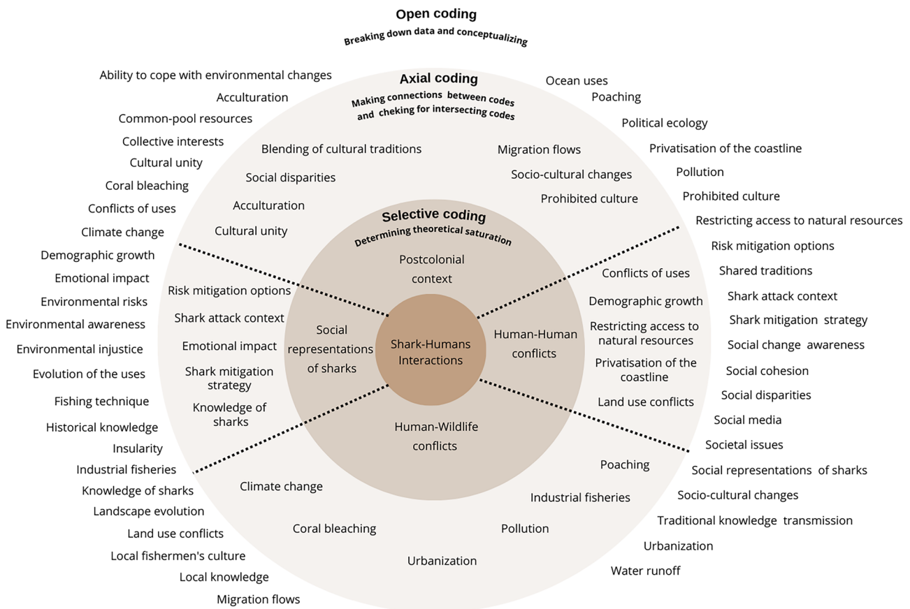
Fig. 2 Schematic representation of the Grounded Theory model

In times of dramatic events the question of the risk is emphasized, meaning there is a sharp focus on the matter. When SHIs dramatically increased in the coastal waters of Réunion, people started talking to a greater extent about it, and soon a whole range of volunteer initiatives and organizations sprung up. During our fieldwork, we observed a shared will among the various stakeholders to minimize future risks of