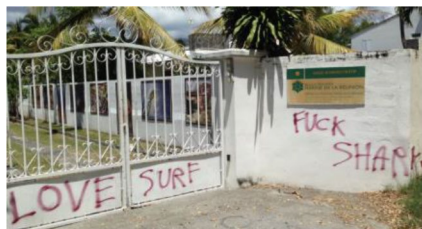
Fig. 4 Deterioration at the entrance to the RNMR premises (December 4, 2018)

These interviews also provided information on poaching. They highlighted that the number of poachers is an indicator of a non-concerted environmental management tool. “There were 90 tickets issued in 2017. The RNMR is among the French natural reserves where the most fines are given... We do a lot of sorting, otherwise it would be around 300 or 400 tickets a year. It has always been, it is anchored, it is like that” (Fredo, RNMR staff). As far as SHIs risk reduction is concerned, relations between the two public benefit