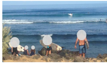
Fig. 3 About fifteen surfers defying the ban on the Trois Bassins spot (Sept. 25, 2018)

This plurality of knowledge is also shared by some water-based practitioners who have adapted to the risk by endorsing new attitudes to cohabit with sharks, by developing strategies to reduce shark-risk encounters. It can be proven by counting increasing numbers of water-based activities practitioners on surfing spots when there is swell coming in, then refusing to conform to the ban. That return to water flow could also be linked with the absence of SHIs since May, 2019, thus conditioning an acceptance of the risk of encounter. This risk-taking is not well accepted by the citizens and the water-based activities practitioners who made the choice to comply with the rules, not returning to water. “ I acknowledge that the underwater lookouts and the no-sharks devices work, but I wouldn't go in the water and be used as bait. I have a little girl and we're expecting another one, so I choose not to be selfish. You can't really talk about it with people who are still surfing. I can not be friends with those people anymore. I think that's selfish of them. ” (Tao, citizen). Parenthood