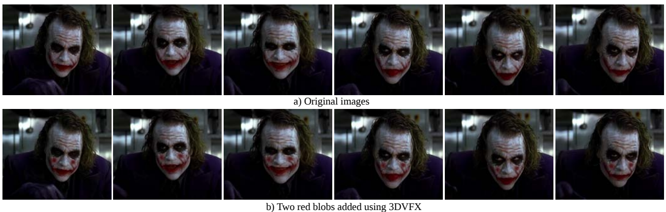
Figure 1: 3DVFX use case. The user provides the object to be added and marks the desired location in one of the images. The rest of the images are modified by transporting the texture across the 3D meshes of the reconstructed surfaces and reprojecting them to the images.

1 EnCoV, Institut Pascal, Université Clermont-Auvergne, France