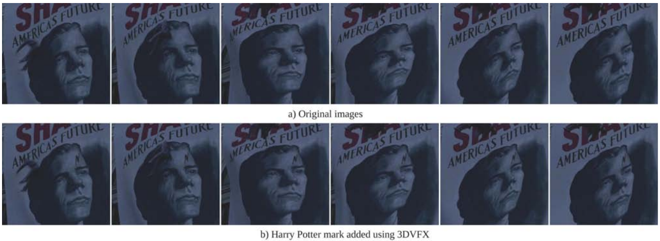
Figure 4: Adding Harry Potter's mark to Shaw's forehead using 3DVFX.