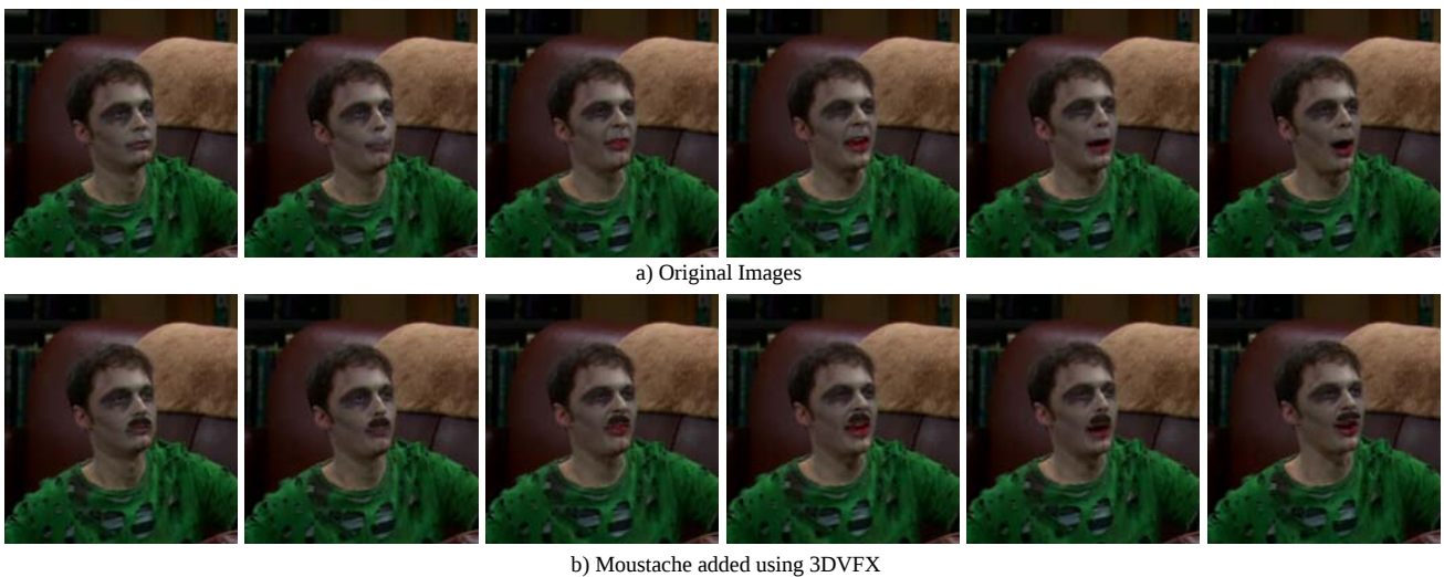
Figure 5: Adding a moustache on Sheldon's face using 3DVFX.