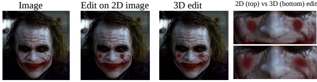
Figure 3: 2D vs 3D editing. 2D editing is unrealistic as it does not consider the underlying geometry of the object.

curvature of the surfaces. Both MT and CS are preserved under an isometric deformation.