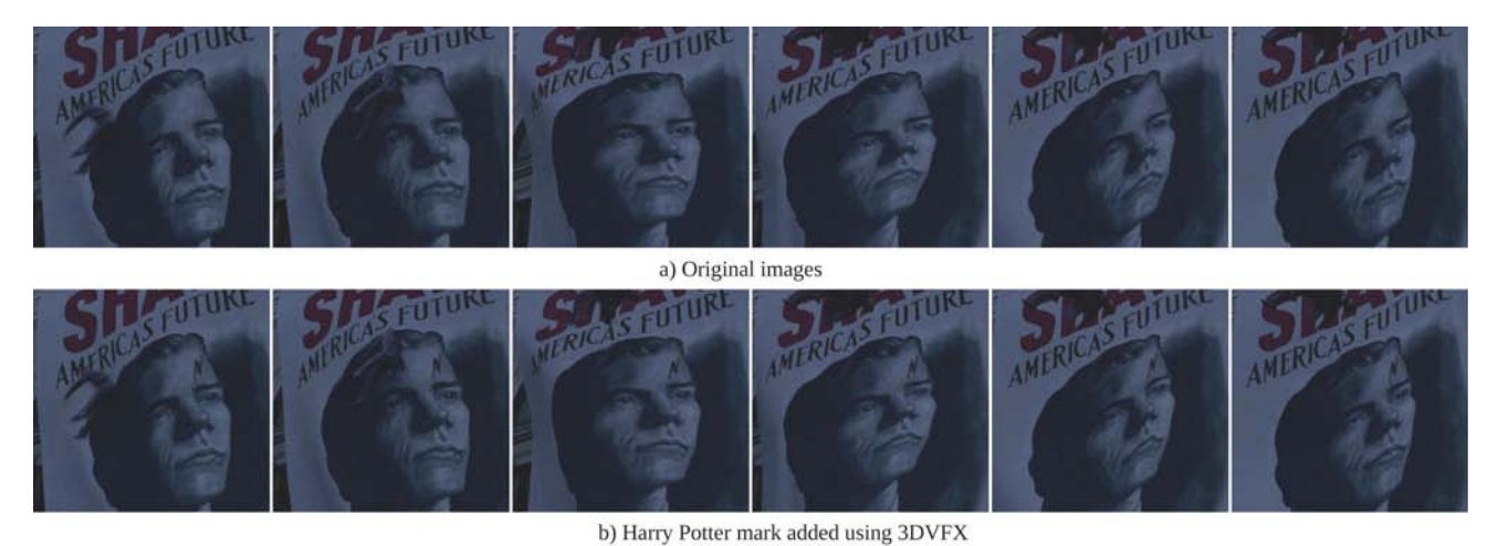
b) Harry Potter mark added dsing 5D VI X