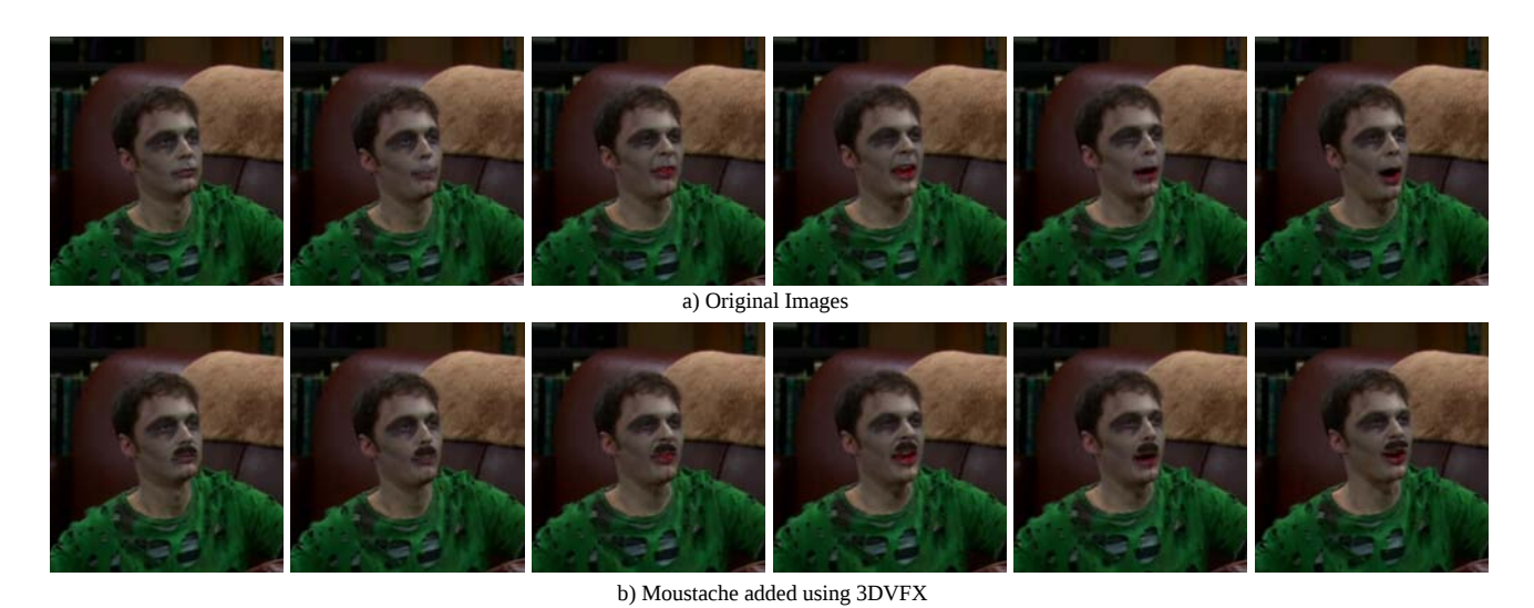
Figure 5: Adding a moustache on Sheldon's face using 3DVFX.