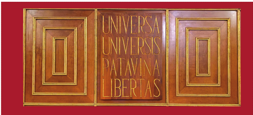
Historical plaque of the University of Padua, cover illustration for Scientiae in the History of Medicine.

ature (with the late E.J. Aiton, not unexpectedly, as a recurring comet) and is always very clear but also enough technical as the subject matter requires: 17 th -century cosmology is co-substantial, so to say, with decisive progress in algebra and analysis and with the birth of modern mechanics and dynamics, both enterprises to which the book protagonists contributed substantially. The authors show more interest in the cosmological theories per se, and their interplay and mutual conditioning with philosophical theories and Weltanschauungen , than in the latter as such; and this is one of many reasons why this book is so solid, and will be found so useful by any reader interested in its subject matter and themes.