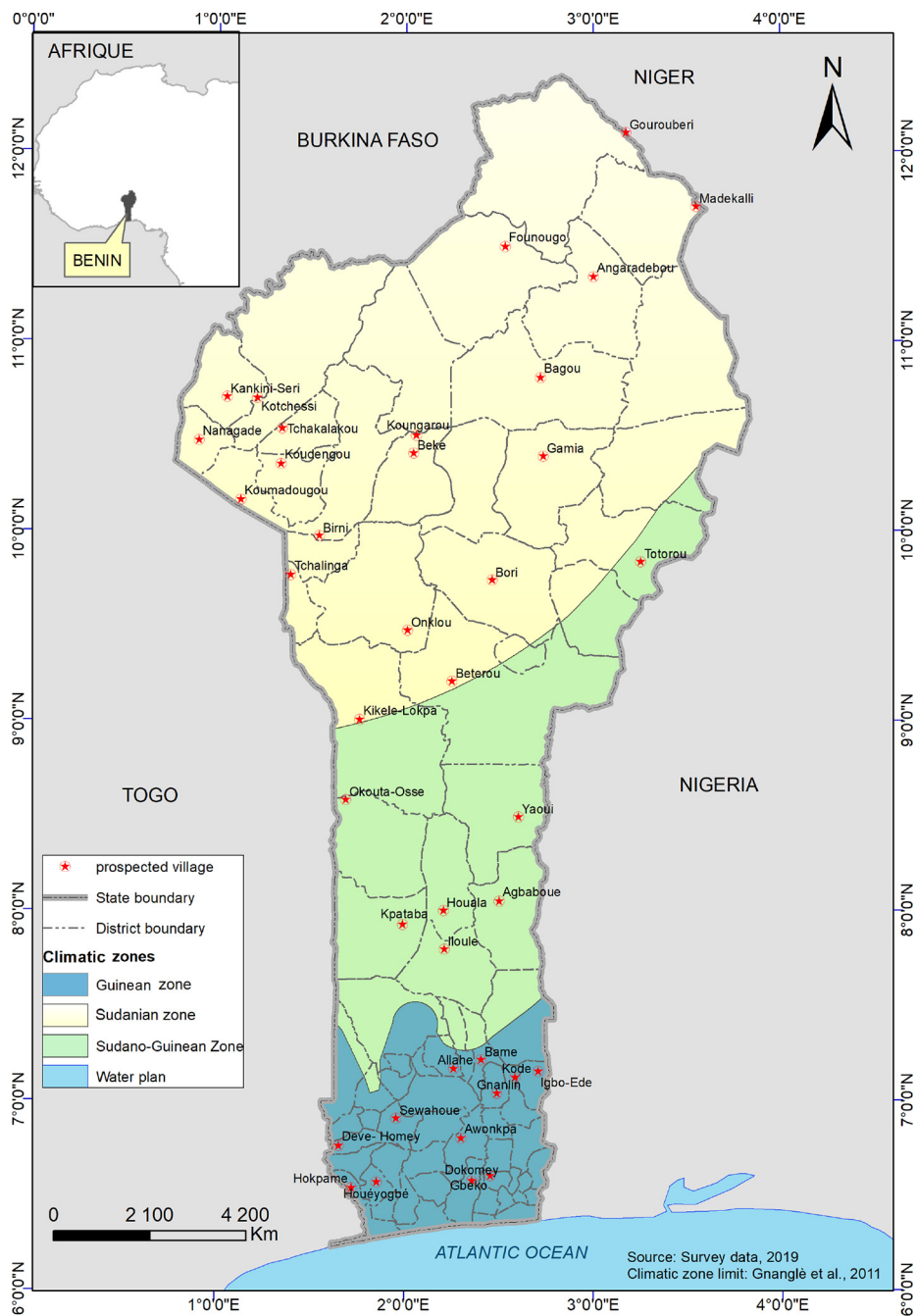
Figure 1. Map of the Republic of Benin showing the 39 surveyed villages