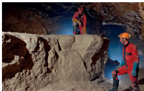
Figure 2: The G 3 karstic infill is a 3 m thick sequence composed of millimetre to multi-centimetre alternation of carbonated silts and clear clays.

thickness, hydrological circulations are limited to the upper third of the ice mass or within the upper 100 to 150 m (Bini et al. , 1998; Irvine-Fynn et al. , 2017). Considering these elements, juxta-glacial hydrological penetration is likely to occur when the ice surface is around 550 m, i.e. more than 250 m below the WGM line, i.e. well after the WGM.