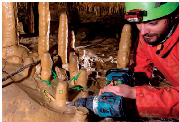
Figure 4: Micro-core drilling of the SANG 20-04 speleothem. Note the shocks (white dots in the green circle) showing the evacuation of the pebbles after growth.

at MIS stages 4, 3 or 2. Unfortunately, as it stands, it is not possible to distinguish between ancient Würm and recent Würm or even to correctly link this sequence to one of the stages of the glacial retreat. However, it has been possible to better constrain the relationship between the glacial dynamics in the valley and the invasion of sediments. The filling of the Sous-les-Sangles cave is an eloquent case that deserves further study. OSL analyses are planned to directly date the detrital deposits.