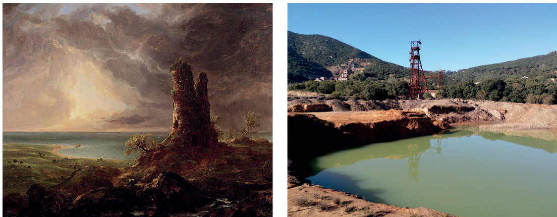
Figure 1. New icons of the contemporary sublime. Diptych of two works in comparison. On the left Landscape with Ruined Tower by Thomas Cole, 1832-36; On the right Pozzo Faina, Montevecchio, Sardinia, Italy by Sardegna Abbandonata, 2022

As Latz argues, there is a different semantic and figurative value to be attributed to such removed landscapes: The new ruins are remnants abandoned by production processes that configure an environment in which "instead of mountain peaks, technological mountain ranges serve as a reference point in orientation within chaotic urban spaces. Their peaks create a visual and aesthetic control of space that has never seemed possible in these environments" (2004). Through this new aesthetic awareness, industrial ruins become identifying objects and landmarks of the territory and, for this reason, are now recognised as pieces of cultural heritage. To prove this, we need only to think of the many tourist routes developed to upgrade the material heritage of the territories that host these "monuments" of contemporaneity.