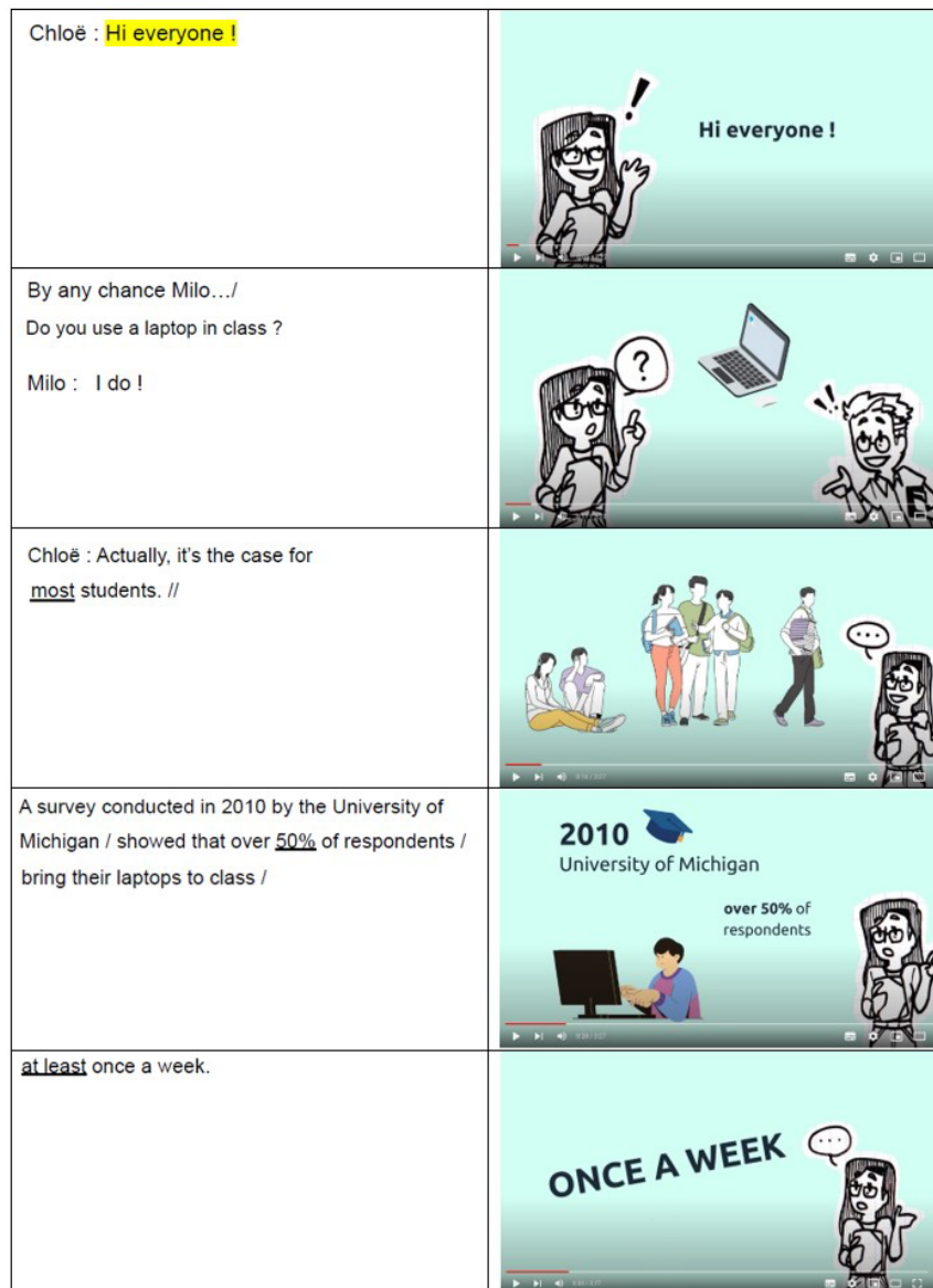
Figure 1 Screen captures and notated script from student-produced video project

In particular, following results from Dressen-Hammouda and Wigham (2022a, 2022b), we would expect for the multimodal rubric to play an important role in redirecting