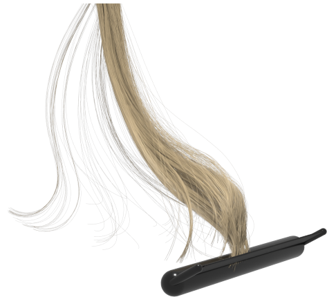
Figure 1: (Left) Comparison of the normalised force \bar{F} as a function of the normalised displacement \bar{\delta} in the frictionless three-point-bending test using a 2D implementation of the Super-Helix model to simulate the rod. Two detections schemes are compared, segments discretisation and exact distance computation, to the analytic solution. (Right) Application of our full pipeline to the challenging simulation of a comb passing into a wisp of hair: 2025 tightly contacting super-helices are simulated with dry friction, resulting in 33100 contacts on average, which are accurately detected using our new curve-curve detection algorithm [3] and resolved precisely with our non-smooth Coulomb friction contact solver so-bogus [4].

The goal of this work is to explore novel algorithms to enhance the predictability of fibre assembly simulators, without sacrificing the complexity of the target scenarios. Our present study is precisely aimed at evaluating and improving the accuracy of the forces computed among fibre assemblies. Computing frictional contact forces emerging from fibre systems in an accurate manner is indeed fundamental to the proper understanding of micro-mechanisms at the origin of macro-behaviours such as adhesion or crackling in fibre assemblies, which still remain poorly understood nowadays [1, 8]. On an applicative point of view, predicting forces correctly would further allow to enhance considerably the predictability of material design, especially for systems requiring high-fidelity restitution of some target properties like the strength, feasibility and sustainability of the design [7], but also the user sensorial experience related to touch or audio sense of reality [10].