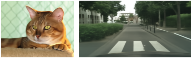
Figure 3: Examples of denoised and upscaled images from the Denoising Diffusion Model. On the left, a Pascal-Context image denoised on size 256 \times 256 and upscaled to 373 \times 480 . On the right, a Cityscapes image denoised on 256 \times 256 and upscaled to 1024 \times 2048 .

scale values of 1, 0.5, and 0.25 respectively. DENOISECERTIFY performs best for a scale of 0.25, corresponding to a Cityscapes image size of 256 \times 512 which is very close to the output of the DDPM. Therefore, the rescaling does not impact the details and overall quality of the denoised image. The same happens for the Pascal-Context dataset, the best performance is obtained for a scale of 0.5 which corresponds to images of size 240 \times 240 , again very close to the 256 \times 256 DDPM output. Training DDPMs on images of higher resolution would be another way to circumvent this limitation. Also, with the improvement of powerful techniques that rely on the denoising backbone, our approach would still be able to leverage the resources made available. We believe that having a denoiser that is also able to upscale images to very high resolutions would allow us to improve our results even further.