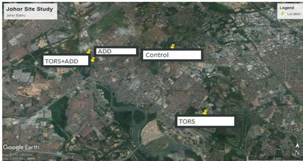
Figure 1: Geographical localisation of the study sites