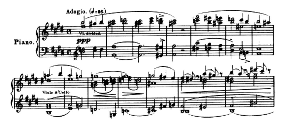
Ex. 1. Giuseppe Verdi, La Traviata , Act I, Prelude.

appointed [...] lounge"; the adverb merely changes from "perfectly" to "admirably", which remains very close in meaning. The first sentences in each opening are built along a chiasmus: the first sentence in Some Do Not... starts with "the two young men [...] sat" and then mentions the location; the opening in No More Parades begins with the location before stating Sylvia's position: "Sylvia Tietjens sat". The second incipit is thus built as a symmetrical reflection of the first one – a notion further sustained by the mention of many mirrors in both passages. However, the reflection is radically altered if one considers the contexts in which each incipit takes place: England in 1912 in the case of the first, France in 1917 for the second, just a few kilometres from the front. The recurrence of the same themes therefore takes place in two drastically different contexts. In this respect, these two incipits may bring to mind opera overtures, which introduce and highlight the action on stage. In Verdi's La Traviata , for example, we find the very same melodic line in the first nine bars of Act I and Act III – the prelude to Act III being set just a half-tone above that of Act I, and the tonality thus shifting from C# minor in the prelude to Act I, to D minor in the prelude to act III.