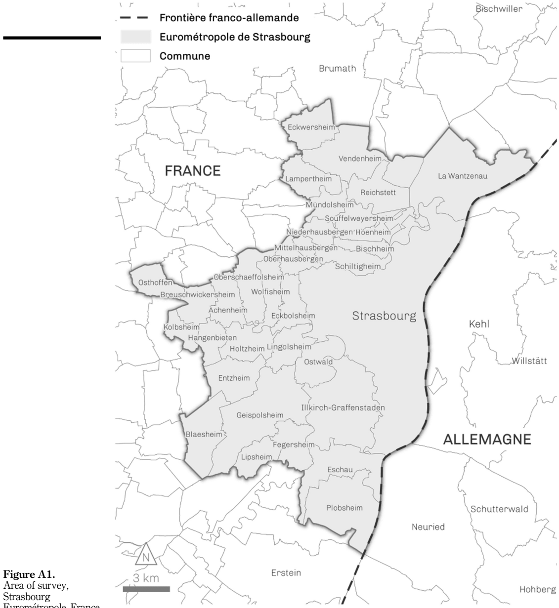
Figure A1. Area of survey, Strasbourg Eurométropole, France

Realisation : Julien Guerard, Avril 2020