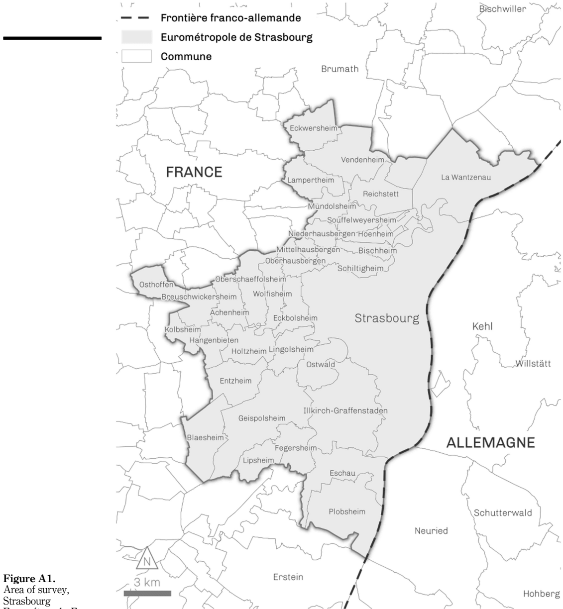
Figure A1. Area of survey, Strasbourg Eurométropole, France

Realisation : Julien Guerard, Avril 2020