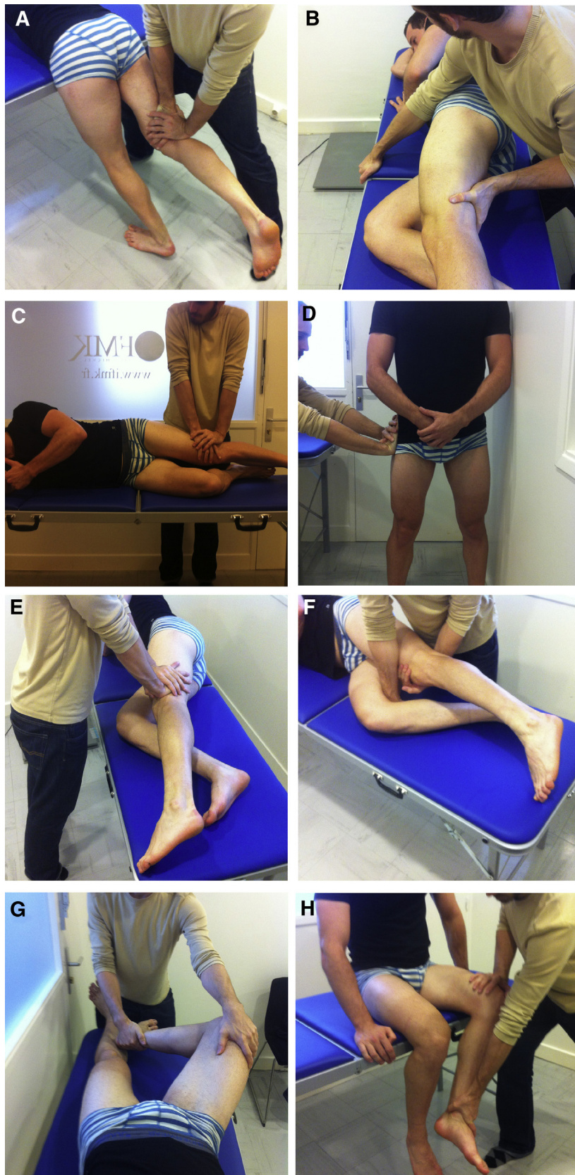
Fig. 1. Maximal voluntary contraction tests. A. TGMax1: hip extension in prone position. B. TGMax2: hip extension in lateral decubitus. C. TGMed1: hip abduction in lateral decubitus (with hip straight). D. TGMed2: hip abduction in bipedal stance. E. TTFL1: hip abduction in lateral decubitus (with hip flexed). F. TTFL2: hip flexion in lateral decubitus. G. TS1: hip flexion/abduction/lateral rotation in supine position. H. TS2: hip flexion/abduction/lateral rotation in sitting position.