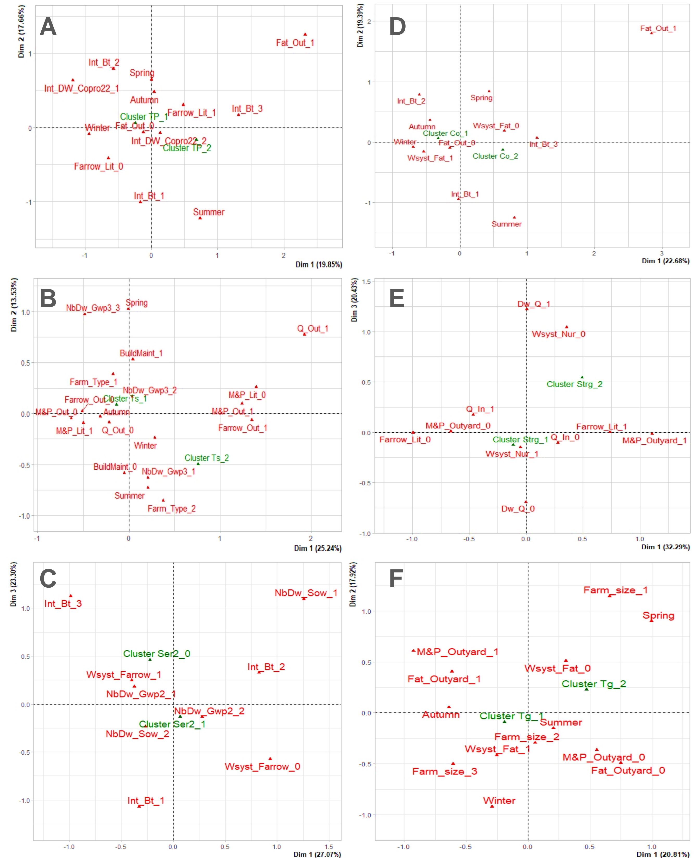
Figure 2: Results of the multiple correspondence analysis between the descriptive variables of the farm, the season during which the visit was made and the classification of the farms according to (A) their level of parasitism, (B) their level of parasitism with regard to strongyles, (C) to Trichuris suis , (D) to coccidia, (E) to their level of seropositivity to Ascaris suum or to (F) Toxoplasma gondii on animals.

Data on the facilities and management of the farm were collected during an on-farm visit and were analyzed using multiple correspondence analysis to determine farm profiles regarding infestation and farm characteristics.