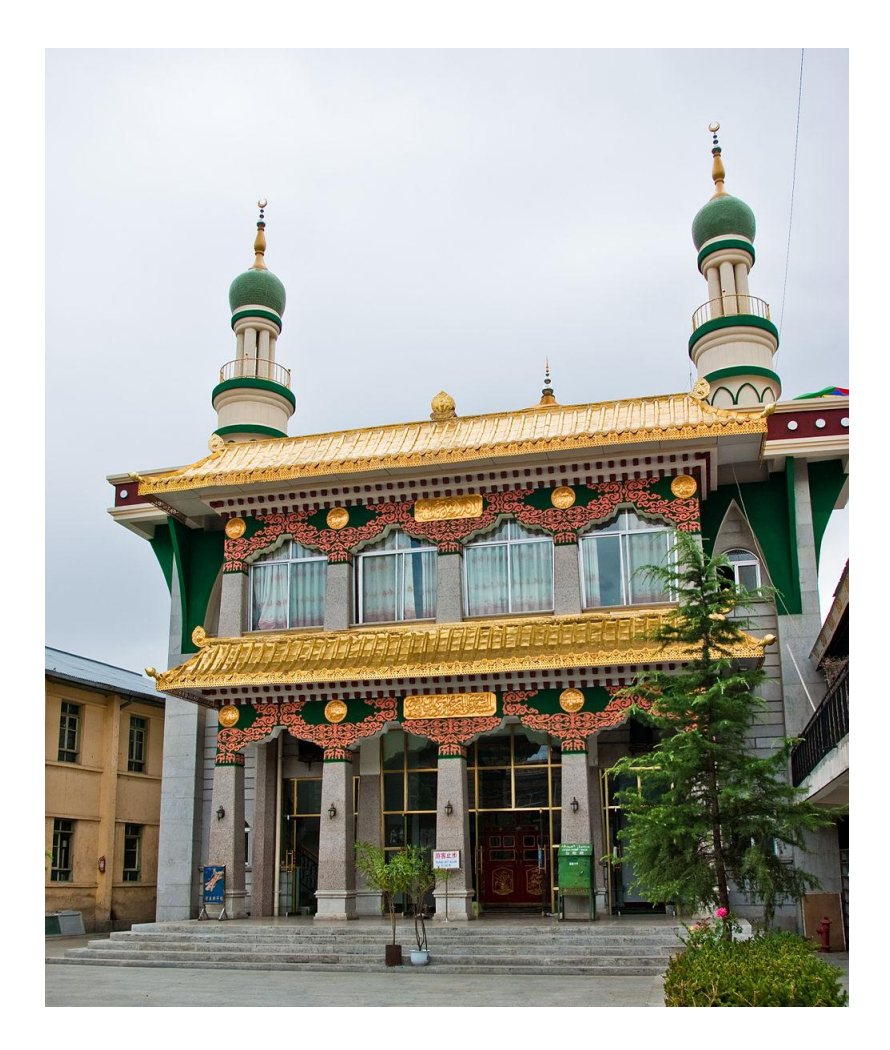
Figure 3: Lhasa Great MosqueSize of this preview: 503 \times 599 pixels. Other resolutions: 201 \times 240 pixels | 403 \times 480 pixels | 645 \times 768 pixels | 859 \times 1,024 pixels | 2,389 \times 2,846 pixels.