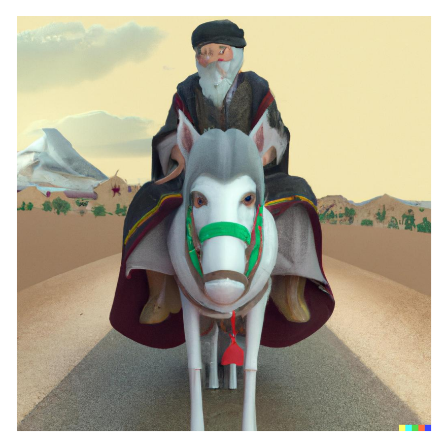
Figure 4: Kashmiri merchant on the silk road