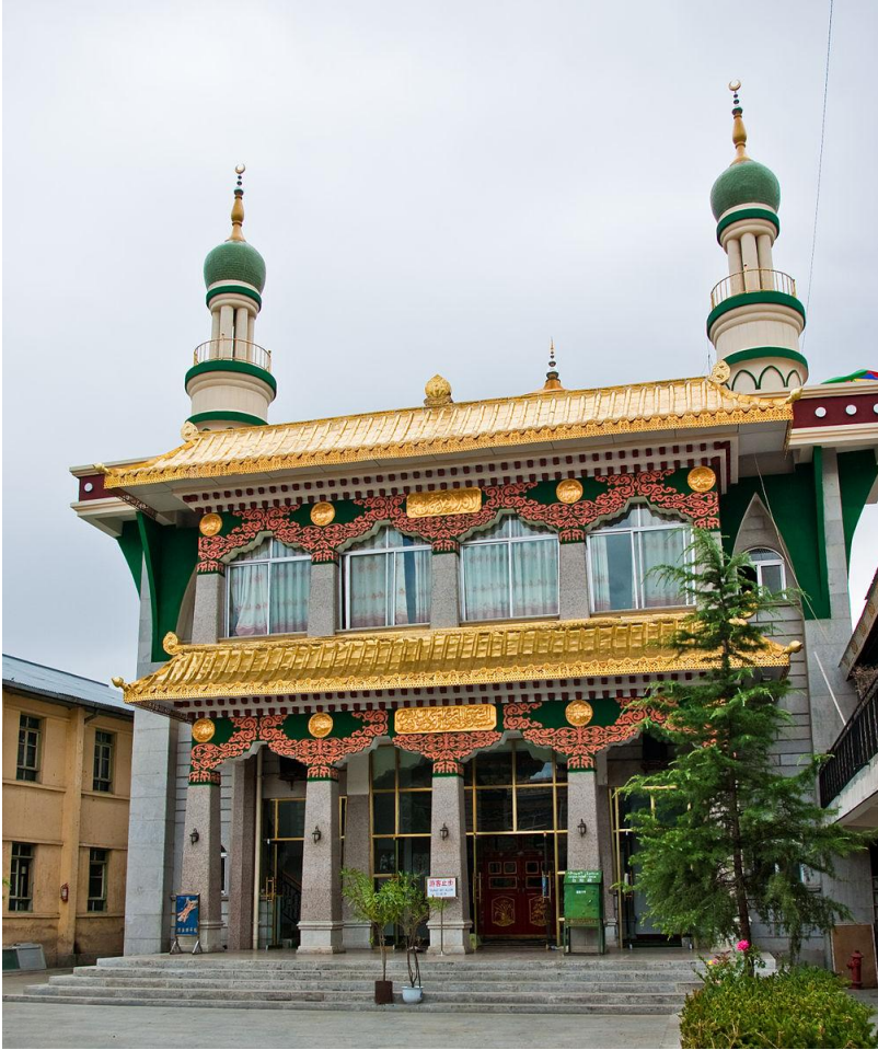
Figure 3: Lhasa Great Mosque

Size of this preview: 503 × 599 pixels . Other resolutions: 201 × 240 pixels | 403 × 480 pixels | 645 × 768 pixels | 859 × 1,024 pixels | 2,389 × 2,846 pixels .