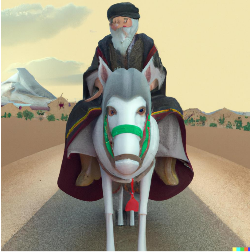
Figure 4: Kashmiri merchant on the silk road