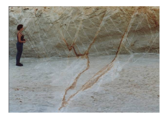
Figure 1 Deformation bands array in the Massif d'Urchaux, showing evidence of their impact on recent groundwater circulations.

The field studies were carried out on high-porosity sand and sandstone outcrops in active and abandoned quarries from the Upper Cretaceous of the Bassin du Sud-Est, Provence, France, which provide excellent 2-D and 3-D exposures of deformation band networks and larger faults. These sands/sandstones are essentially composed of a large range of quartz grain sizes which vary between the study areas. These sands generally have a marine origin from deltaic to beach sands, with some aeolian levels. The sand outcrops show a low to moderate cohesion between the quartz grains due to a lack of cement, but nevertheless can form vertical quarry faces for some months to years before erosion and outcrop collapse sets in. These sand units have recorded a low depth of burial, possibly less than 1000 metres in some cases. Nevertheless, deformation bands and larger faults show extensive microstructural evidence for intragranular fracturing and cataclasis, although they are mostly uncemented. Field evidence for the influence of deformation bands on recent groundwater circulations is frequently observed (Fig. 1).