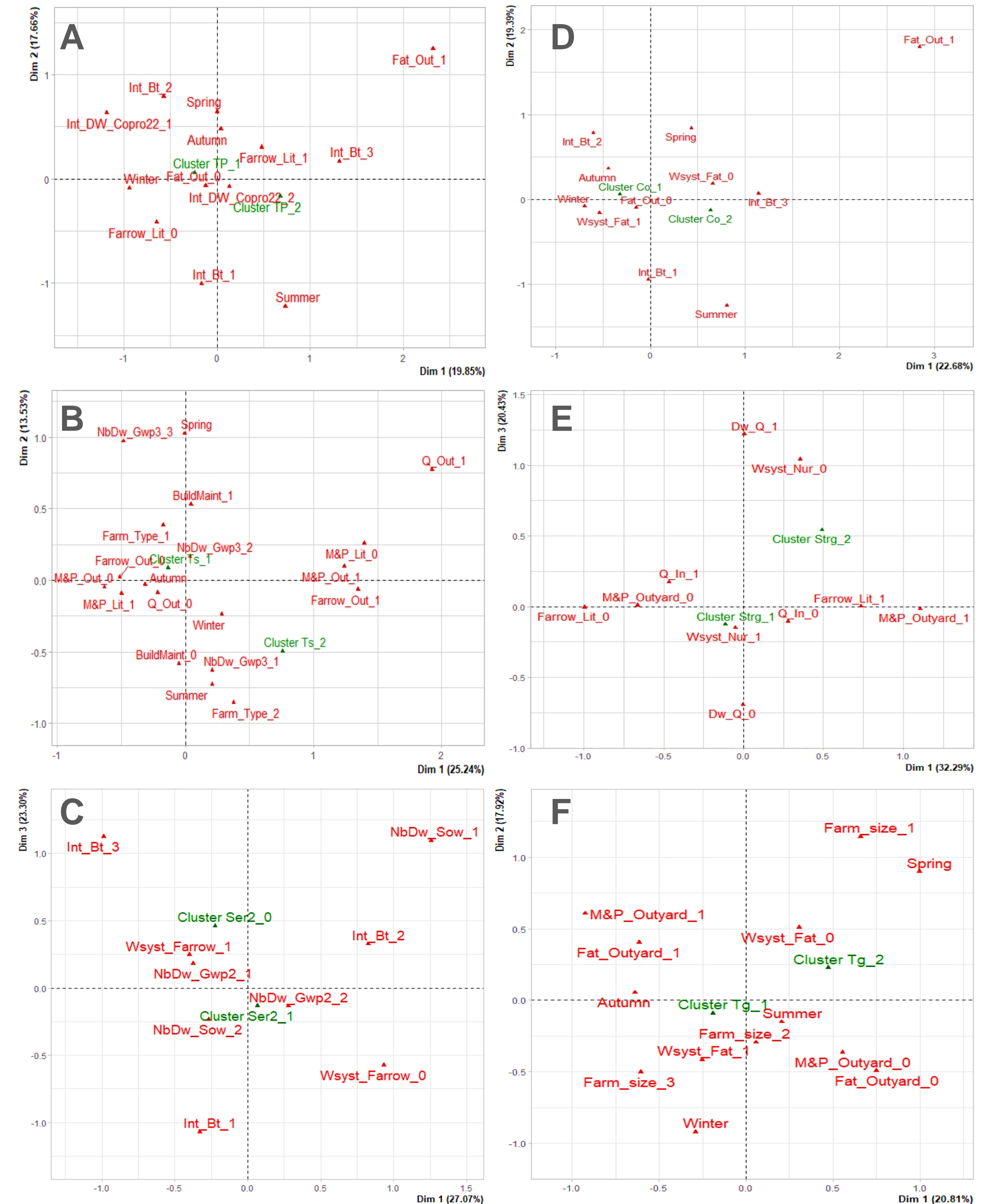
Figure 2: Results of the multiple correspondence analysis between the descriptive variables of the farm, the season during which the visit was made and the classification of the farms according to (A) their level of parasitism, (B) their level of parasitism with regard to strongyles, (C) to Trichuris suis , (D) to coccidia, (E) to their level of seropositivity to Ascaris suum or to (F) Toxoplasma gondii on animals.

Data on the facilities and management of the farm were collected during an on-farm visit and were analyzed using multiple correspondence analysis to determine farm profiles regarding infestation and farm characteristics.