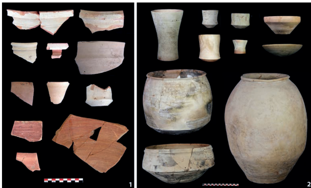
Fig. 3. Ulug-depe, vases from the Yaz II period: 1. Phase 1; 2. Phase 2 Улуг-депе, вазы периода Яз II: 1. фаза 1; 2. фаза 2