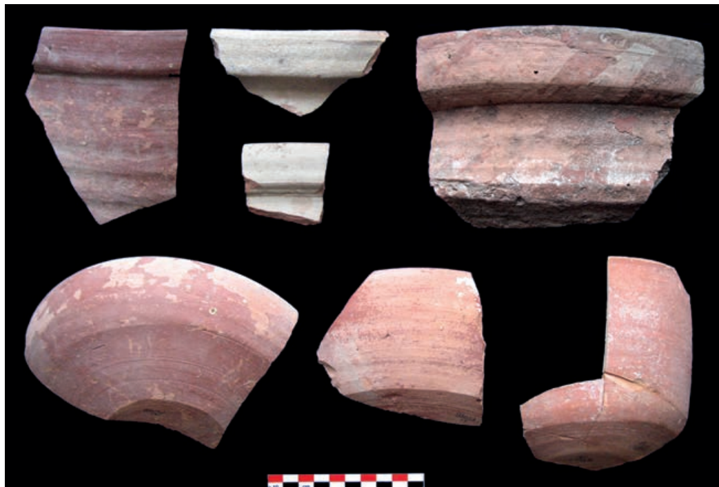
Fig. 6. Kjuzeli-Gyr, vases from the Yaz II-III periods (© J. Lhuillier, courtesy State Oriental Museum, Moscow) Кюзелигыр, вазы периодов Яз II-III (из коллекций Музея Востока, Москва)