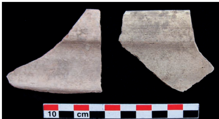
Fig. 4. Kuchuk-tepe, bowls with banded rims Кучук-тепе, сосуды с воротничковым венчиком