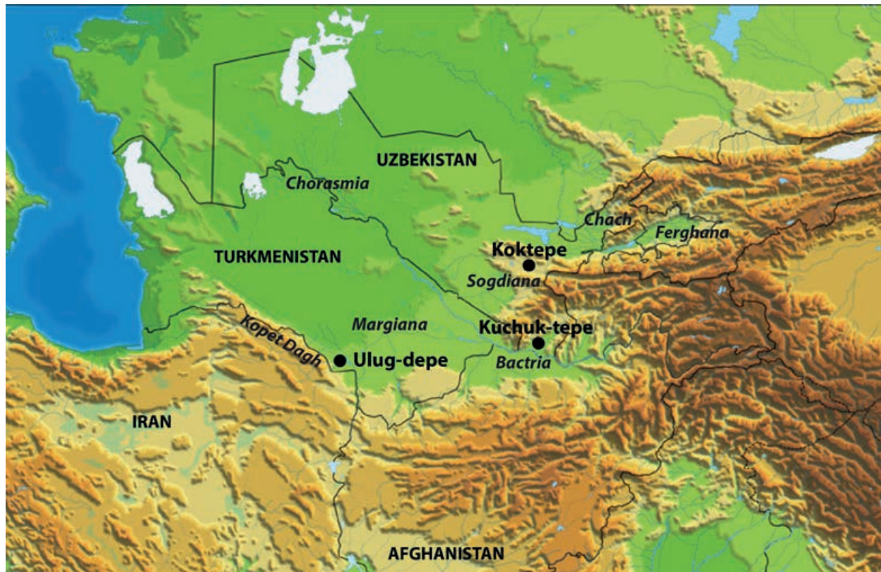
Fig. 1. Map of regions and sites mentioned (© J. Lhuillier) Карта регионов и памятников, упоминаемых в тексте

(Lhuillier, 2018; Briant, 2020). This period is generally considered to be the Yaz III period; therefore, the term Yaz III is used here as a chronological marker for the last period of the Iron Age, rather than as a term for the period of Achaemenid control.