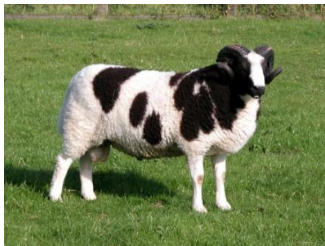
Fig. 5 Spotted sheep Jacob Sheep

In a few instances, sheep are said to be spotted (gun 3 -a). Their present-day name, ‘Jacob sheep’ (Fig. 5 Spotted sheep Jacob sheep), originates from Genesis 30: 25-43, which explains the breeding method used by Jacob to obtain his wages from the flock of Laban, which consisted of black, spotted, speckled and striped sheep and goats.