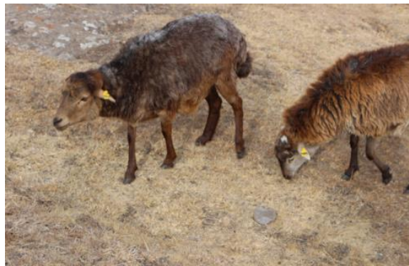
Fig. 4 Brown-red sheep-Menz Breed Ethiopia

Brown-red sheep (udu su 4 ) are not very common, but may appear in large numbers, listed together with sheep of different colours in Ur III texts (Fig. 4 Brown-red sheep Ghezel sheep)