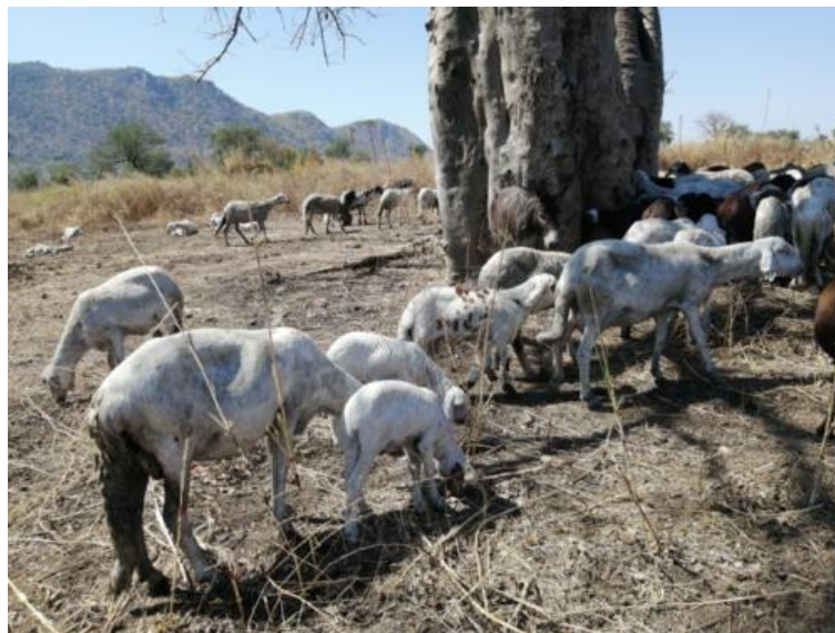
Fig. 3 Long tailed Gumz breed Ethiopia

Other breeds are referred to as ‘long tail sheep’ ( udu kun-gid 2 ) (Fig. 3 Long tail sheep Tsigai sheep), which mainly occurs in texts from the 21 st century BCE from the kingdom of Ur (Ur III) while ‘extra-large fat-tail sheep’ ( udu gal tabbum ), appears as a less common local variety in the same documentation.