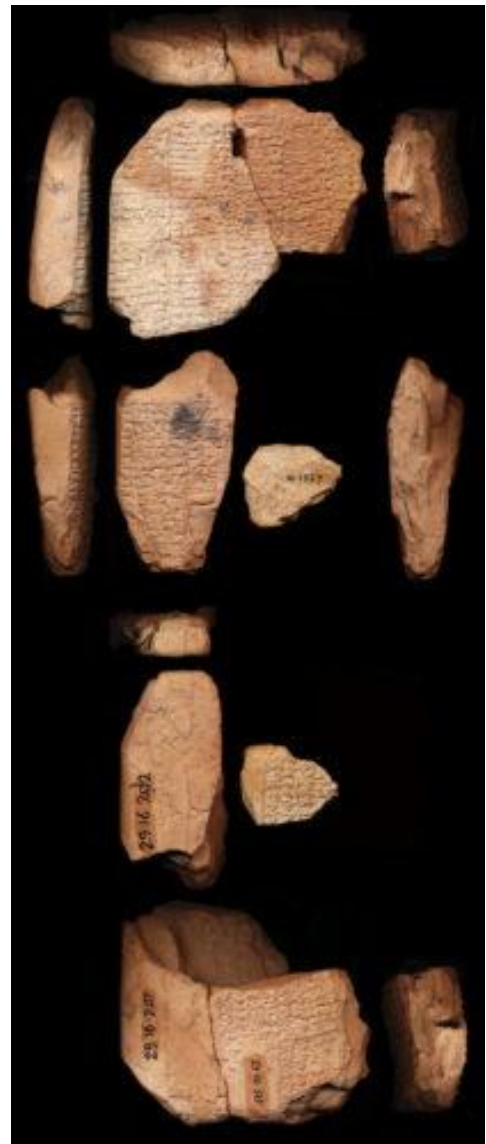
Fig. 1 Old Babylonian Nippur ura3 lexical list CDLI P228711

Cuneiform sources from the third and early second millennia provide much evidence on the varieties of sheep and sheep husbandry. They originate from major cities of southern Mesopotamia such as Ur, Uruk, Umma, Girsu, and Isin. Important data also come from the Middle Euphrates and Central Anatolia. These texts, written in Sumerian and Akkadian languages, include mainly letters, contracts and administrative documents produced by palaces, temples and family households. Lexical lists, especially from Nippur, provide a whole categorization of sheep according to their origins, age, gender, colour, as well as practical vocabulary related to their exploitation and the management of flocks OB Nippur ura 3 . (Fig. 1 Old Babylonian Nippur ura3 lexical list CDLI P228711 ).