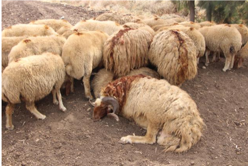
Fig. 2 Fat tailed Awassi breed Lebanon

Take from your people one thousand fat-tailed sheep, (that is) 500 male fat-tailed sheep and 500 fat-tailed ewes, and bring them to me.