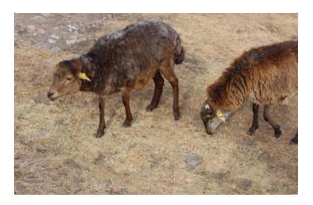
Fig. 4 Brown-red sheep-Menz Breed Ethiopia

Brown-red sheep (udu su<sub>4</sub>) are not very common, but may appear in large numbers, listed together with sheep of different colours in Ur III texts (Fig. 4 Brown-red sheep Ghezel sheep)