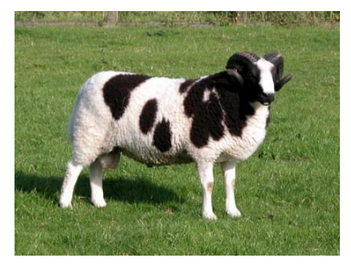
Fig. 5 Spotted sheep Jacob Sheep @Livestock of the World

In a few instances, sheep are said to be spotted (gun<sub>3</sub>-a). Their present-day name, 'Jacob sheep' (Fig. 5 Spotted sheep Jacob sheep), originates from Genesis 30: 25-43, which explains the breeding method used by Jacob to obtain his wages from the flock of Laban, which consisted of black, spotted, speckled and striped sheep and goats.