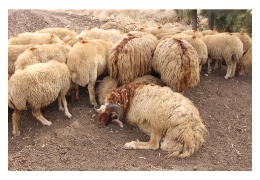
Fig. 2 Fat tailed Awassi breed Lebanon

Take from your people one thousand fat-tailed sheep, (that is) 500 male fat-tailed sheep and 500 fat-tailed ewes, and bring them to me.