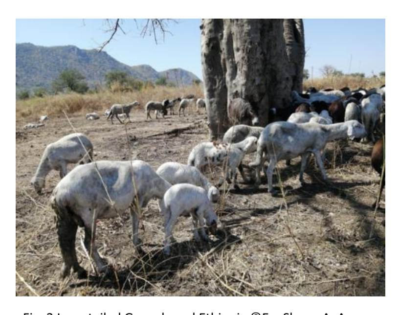
Fig. 3 Long tailed Gumz breed Ethiopia

Other breeds are referred to as 'long tail sheep' (udu kun-gid<sub>2</sub>) (Fig. 3 Long tail sheep Tsigai sheep), which mainly occurs in texts from the 21<sup>st</sup> century BCE from the kingdom of Ur (Ur III) while 'extra-large fat-tail sheep' (udu gal tabbum), appears as a less common local variety in the same documentation.