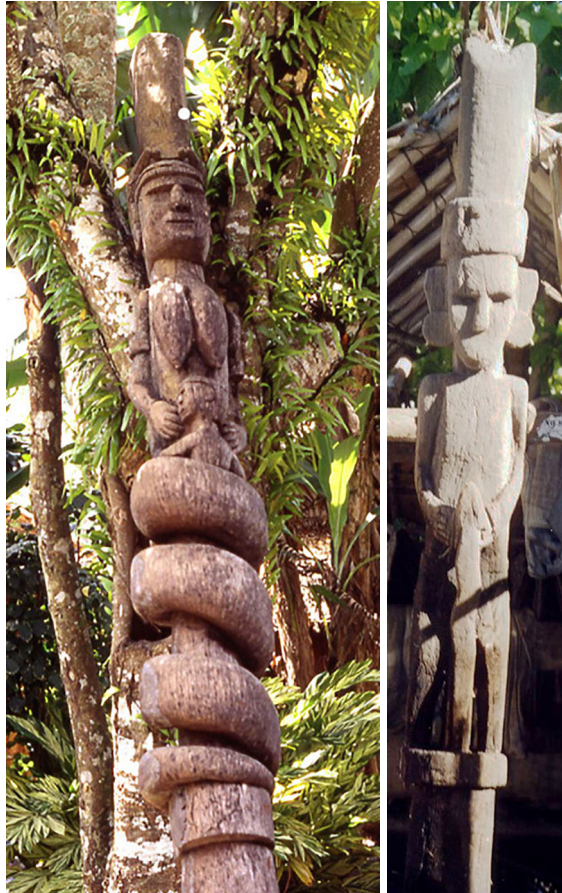
Figure 6: & 7: At the initiative of the elders of the lineages, great mourning closing ceremonies (farunga) are regularly organised for those who have died in previous years. These require the construction of collective ruma ni farunga houses, whose roof support posts are sculpted with beings that are often hybrids, particularly Kafasiqari. She appears in the form of a snake or a being combining human and reptilian attributes.