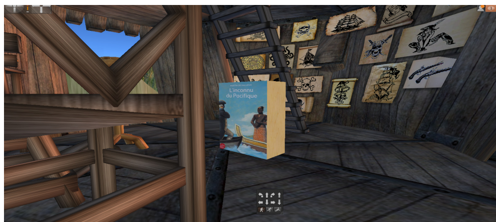
Figure 1. Photograph 1. In the pirate port, the headquarters of an explorer group.

For the French lesson, the teacher designed an activity within the interdisciplinary projects ‘Explorateurs’ (Figure 1). She divided the class into various groups, each taking on the identity of an explorer. Each of them was assigned a book and several students. Various activities were carried out, such as writing a poem. The students had to share ideas through the chat. This teacher’s creativity led her to ideate Headquarters (HQ) for each explorer in a location called ‘Pirate Port’ built specifically for this great explorers’ project. Two elements indicated the location of each headquarter: a cube to which the cover of the book in question was affixed and the coat of arms of the explorer invented by the students. For each group activity, the students, via their avatars, met in their respective headquarters to exchange and solve the language learning task. The students were both in a physical area of the classroom and in a virtual location symbolising their working theme.