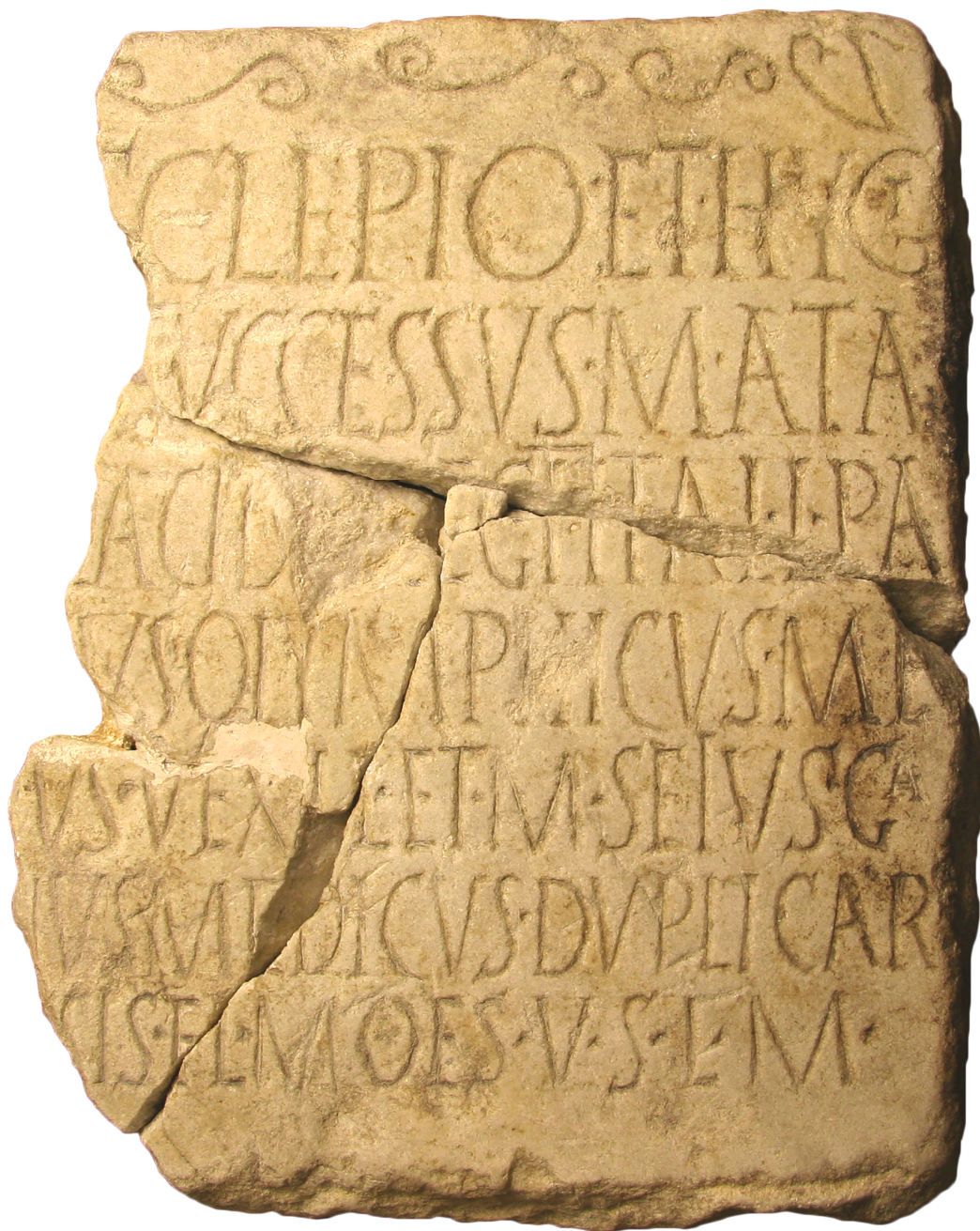
Fig. 1. Dedication of the soldiers of the Legio I Italica and military doctors to Asclepius and Hygia (Odessa Archaeological Museum, Inv. No. 88200).

The dimensions of the epigraphic field are 24.8×23.6 cm. The upper margin filled with floral ornament is 4.0 cm high, the lower one is 2.3 cm high, the right side of the inscription reaches the edge of the panel. The letters are deeply and neatly cut, decorated with small serifs and have slightly elongated proportions. The last letters in the first and fifth lines are reduced in size and cut inside preceding letters. All