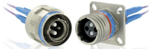
Fig. 2: Example of multipoint aerospace grade connectors with expanded beam fiber

More, only one microlens fiber can be used as a simple collimator allowing better interaction of the light with any gaseous, liquid or solid medium [5]. In the same way, sensitive functions can be added in between the fibers thanks to the relaxed axial and lateral positioning tolerances. In the future, multimode fiber spliced between two single mode fibers could be a way for low-cost and simple interrogation technique as studied in [6].