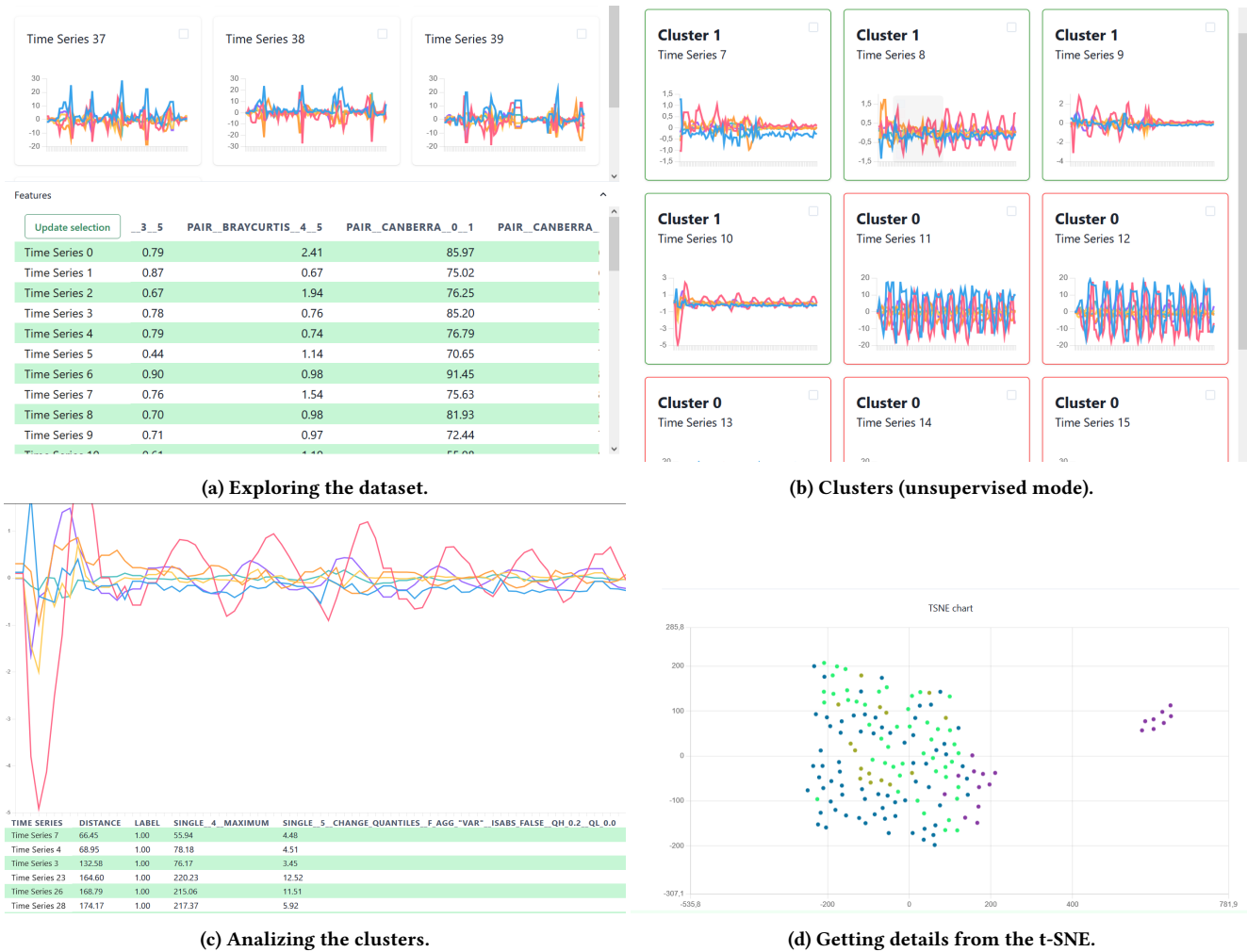
Figure 3: Time2Feat at work.

of the result measured with the Adjusted Mutual Information (AMI) is around 0.35. The reason for the low quality result (that in any case overcomes the competing approaches [2]) is mainly due to the complexity of the problem. By running the semi-supervised mode and providing 20% of labels the quality of the clusters improves to 0.56. Figure 2 shows a representation of the dataset with a 2 dimensional t-SNE representation [9]. Even if it is possible to discriminate users playing badminton or squash, the difference between the shots cannot be easily identified. If the user selects to generate 2 clusters, Time2Feat is able to better discriminate between the activities. The AMI obtained with the unsupervised approach is 0.77 and the one with the semi-supervised approach is 0.86.