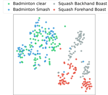
Figure 2: A t-SNE representation of the RacketSports dataset

provided to us. Time2Feat through the Feature Extraction component, generates 4722 intra-signal and 120 inter-signal features to describe the dataset. While individually interpretable, the sheer number of features can produce noise in the generation of the clusters and cannot be managed by users for their interpretation.