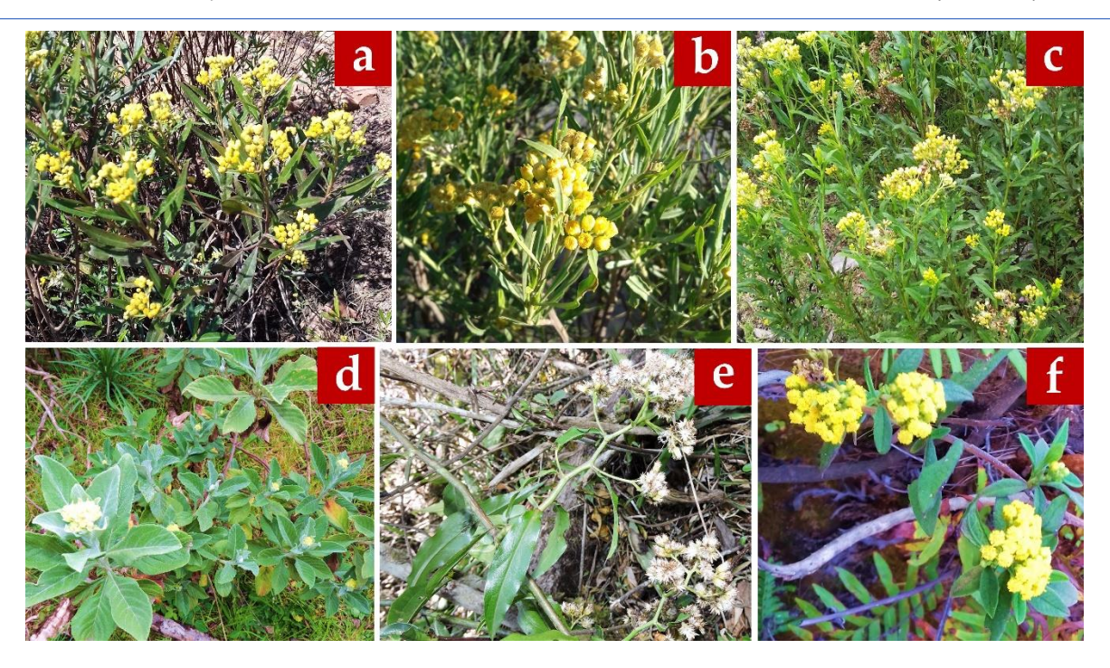
Figure 1. Pictures of the six Psiadia species investigated: a - P. altissima (PAL), b - P. stenophylla (PST), c - P. hispida (PHI), d - P. leucophylla (PLE), e - P. lucida (PLU) and f - P. salviifolia (PSA).

roots have been used by the Maasai to fight malaria [10]. P. altissima , P. salviifolia and P. lucida are three well-known species in the Malagasy pharmacopeia. Their leaves are notably used to treat tooth [3,11,12], and stomach aches [13] and skin diseases like scabies, eczema and wounds [11,12,14–16]. They are also recognised for their hemostatic, anti-diarrheal, carminative, anti-hypertensive and disinfectant properties [17–21].