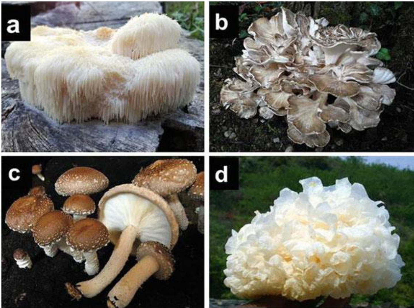
Fig. 2 Fruiting bodies of edible potential neuroprotective macrofungi: (a) Hericium erinaceus (Photo Courtesy of Angelini C), (b) Grifola frondosa (Photo Courtesy of Angelini C), (c) Lentinula edodes (Photo Courtesy of Angelini C), (d) Tremella fuciformis (Photo Courtesy of Callac P)

The advances in fungal biotechnology and cultivation will assist in the production of novel biotech products and their biomedical usage. The clinical trials and in vitro animal studies justify the experience of traditional medicine and suggest a great potential of mycopharmaceuticals for the prevention and treatment of various diseases. However, developments of standardized biotech products for further clinical trials are needed to substantiate the pharmacological properties or side effects of consumption of macrofungi before their clinical application. Thus, advances in fungal biology and biotechnology, genomics and proteomics are required for further biomedical research and usage of macrofungi.